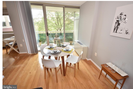
Separate dining leads to balcony