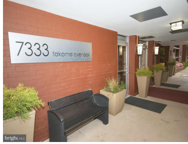
Takama Overlook Condominium