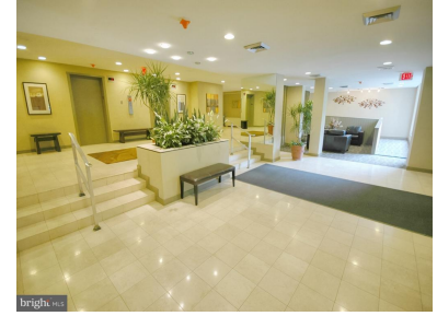
Marble lobby three elevators