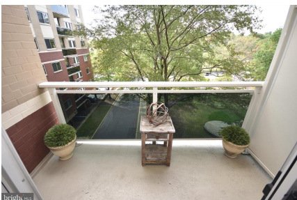
West facing balcony