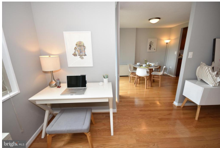
Open floor plan