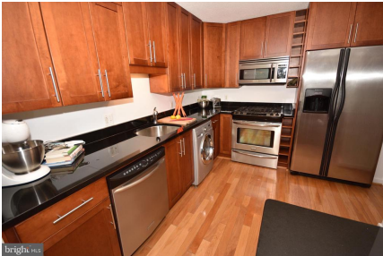
Stainless steel appliances