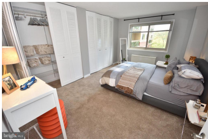
Double closets with ClosetMaid system