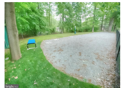
Fenced in dog park