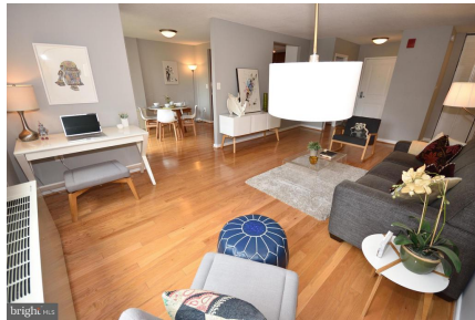
Open floor plan