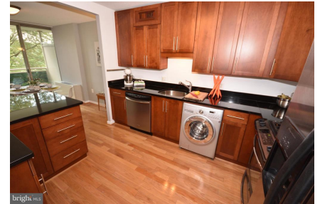
42" Maple cabinets