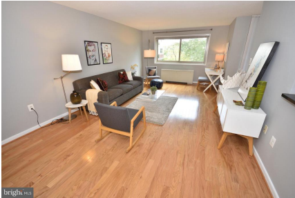
Welcome to Unit # 501