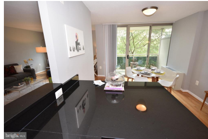
Granite breakfast bar