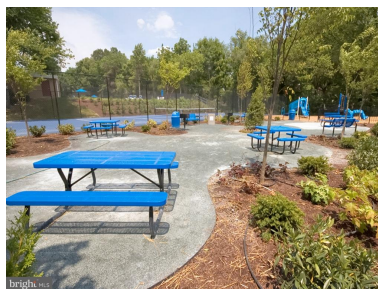
Barbeque Picnic Area