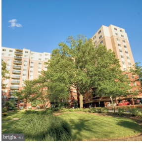
Takama Overlook,, full service building pet friend