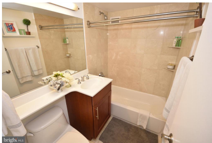
Marble surround bathroom