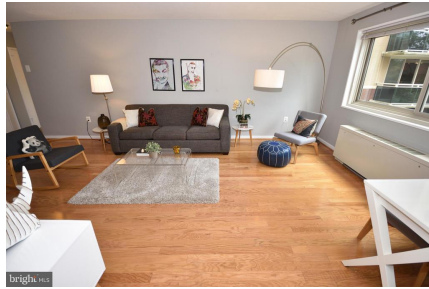
Bright with big windows