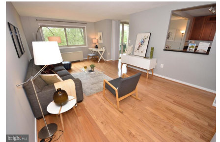
Kitchen pass thru