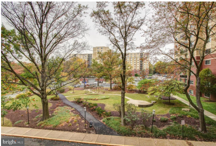
View from balcony