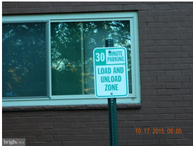
Exterior Parking 30 min Parking