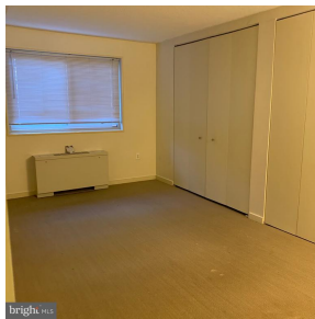
Bedroom with 2 spaces closets