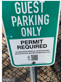
Register to park for visitors