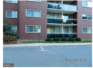
Exterior 30 min Parking