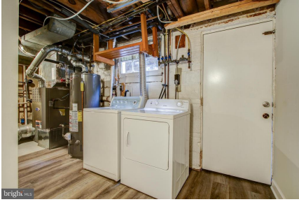
laundry and exit to rear yard