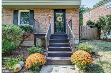
Brazilian Epay wood steps