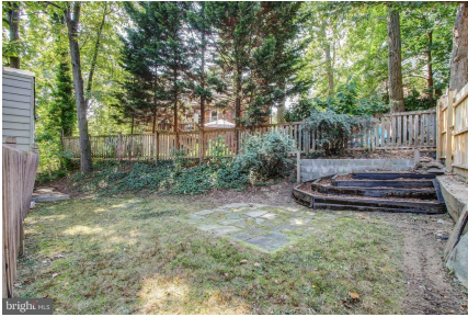
Raised garden beds