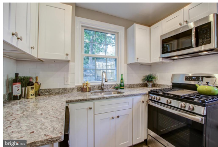
Granite counters and stainless steel appliances