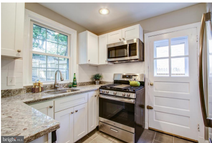
newly remodeled kitchen