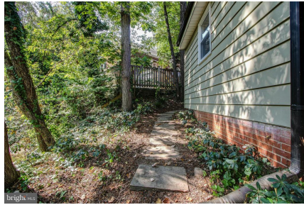
Slate paved path to rear yard