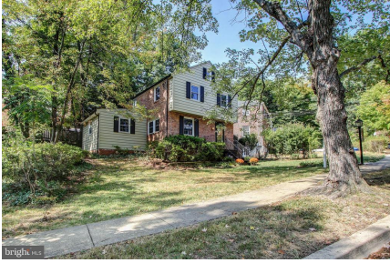
Quiet block in Between the Creeks neighborhood