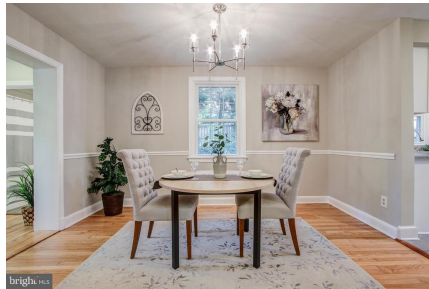
Formal dining room