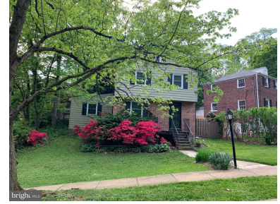
Azaleas in Spring!