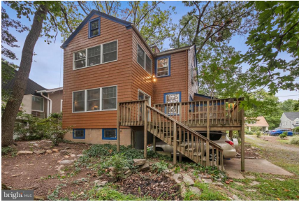
The perfect spot to enjoy nature.