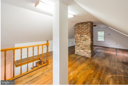
...or an overabundance of storage.