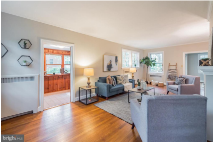
The spacious, light-drenched living room...