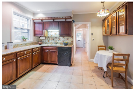
brand new dishwasher (to be installed)