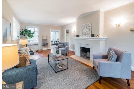
...includes a wood-burning fireplace,