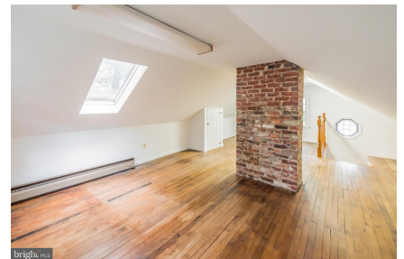
Finished attic would be the perfect playroom...