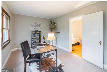
Whatever your heart desires.