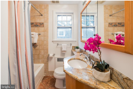
Main bathroom has granite counters,