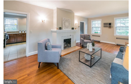
stunning wood floors, wall sconces,