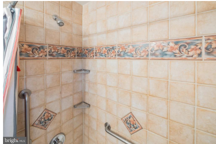
ceramic tile and great linen closet.