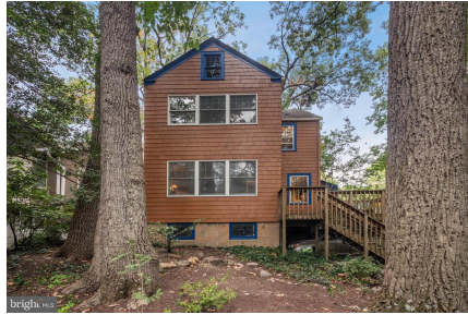
Perfect Takoma Park!