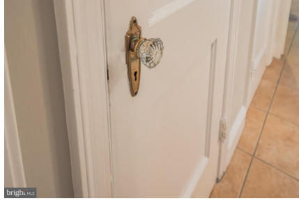
Vintage hardware throughout house.