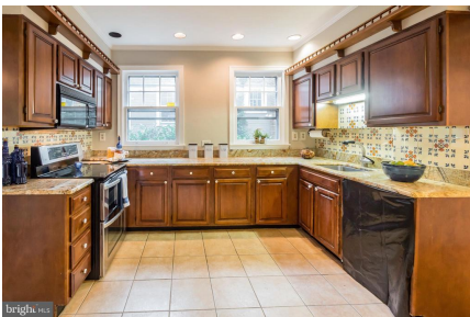
granite countertops with plenty of prep space,