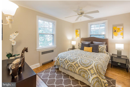
Front corner bedroom gets morning sun...