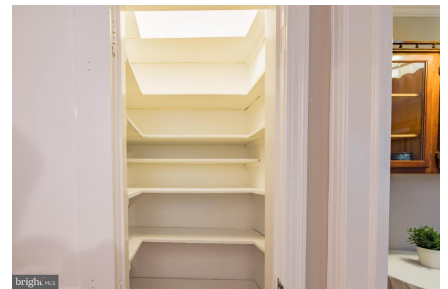
...and huge pantry.