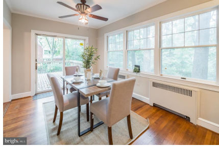
Sliding doors provide easy access for grilling.