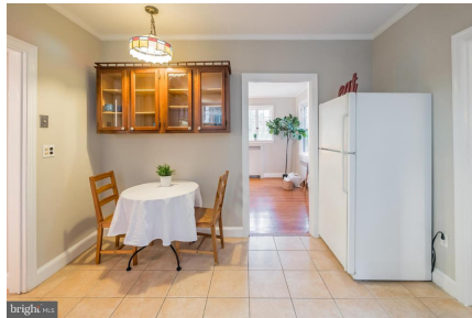
Generous, eat-in kitchen offers