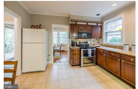
loads of storage, charming tile backsplash,