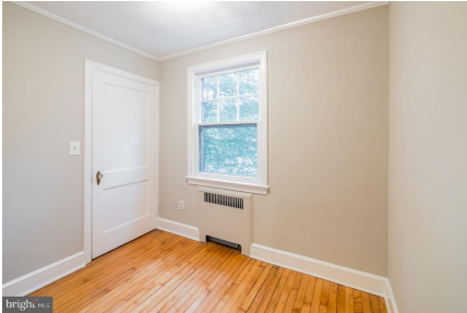
Cozy 4th bedroom provides attic access.