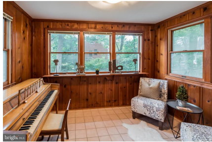
Additional knotty pine sunroom off living room.