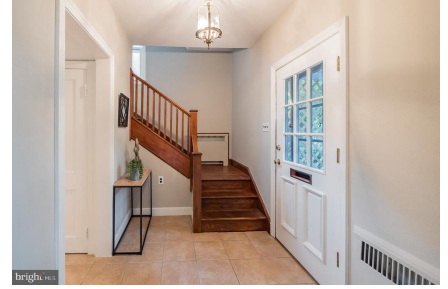
Built in 1933, it still retains original charms.