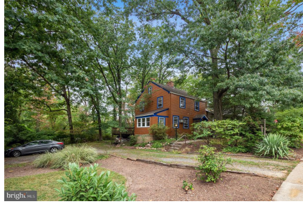
This home is situated on a 1/2 acre wooded lot.