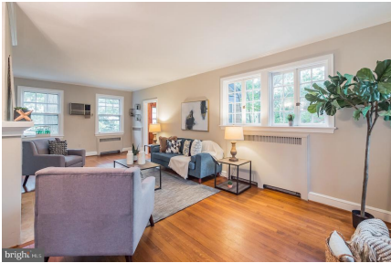
...and original wooden windows.