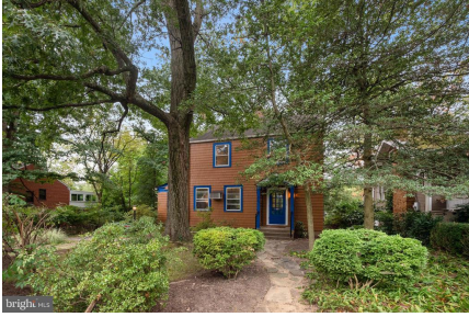
Quintessential Takoma Park MD!