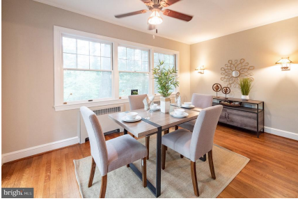
Formal dining room with craftsman light fixtures.