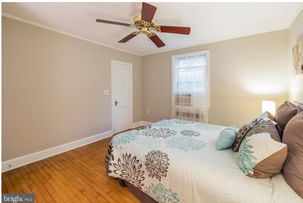
...and a huge closet.