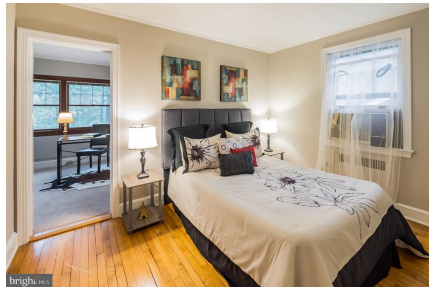
Third full sized bedroom provides access to office