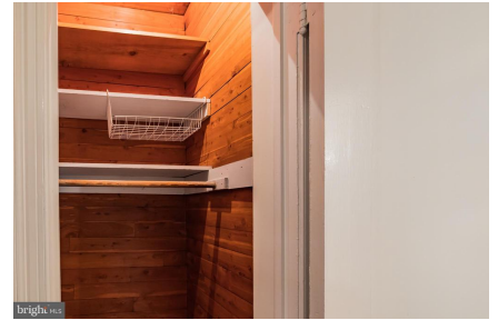
Cedar-lined coat closet off main hall.