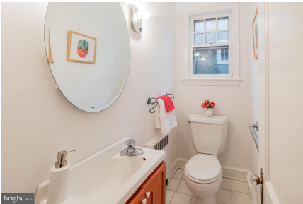
Main level powder room for guests.