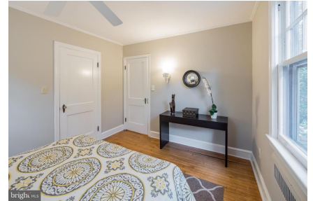
...and is quite roomy.