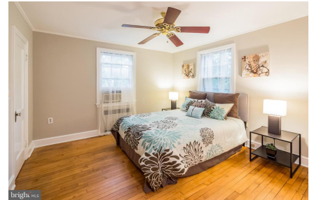
Rear corner bedroom has southern exposure...