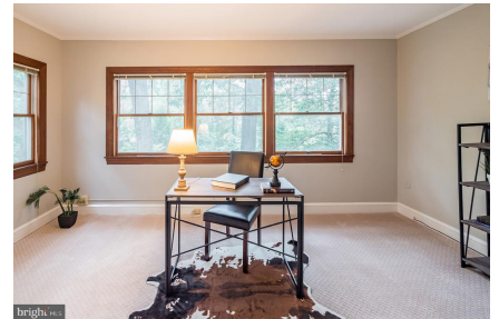
Serene back office perfect for teleworking...