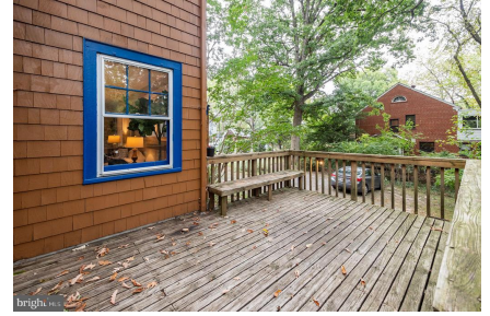
Or simply dine outside on the deck.