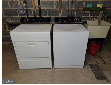
Washer and Dryer