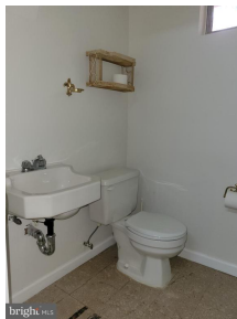
Basement Half Bath