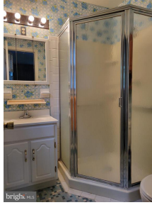
Bedroom 1 Bath