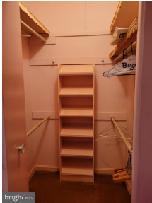
Bedroom 2 Closet