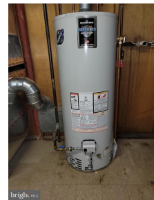
Newer Water Heater