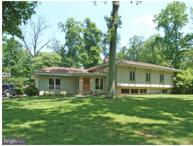
Front Close Up