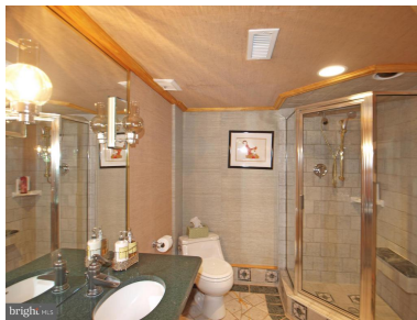
Bath in Lower Level