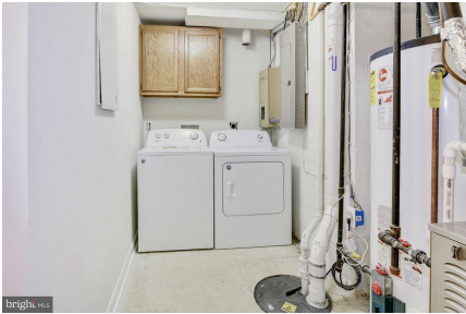
Basement level Washer and Dryer with HVAC Area