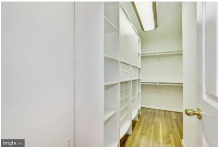
Master Bedroom Closet