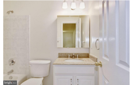
BEd Room #4 in-room Full Bath