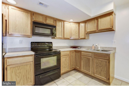
2nd Kitchen on Basement Level