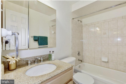
Bath (for the Den)