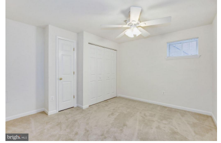
Den (Could be converted to a bedroom)