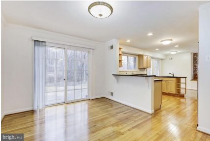
Dining Room into Kitchen