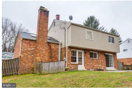
Back of house