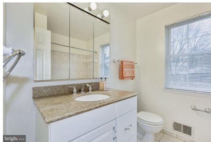
Hall Bath (between bedrooms 2 & 3)