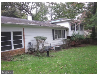
Back of Home