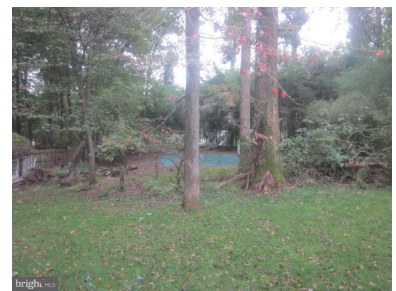
Backyard / Pool