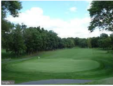
18 Hole Golf Course