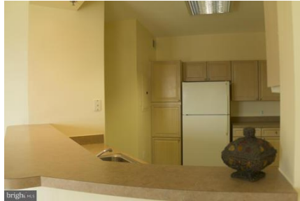
Pass-thru into kitchen