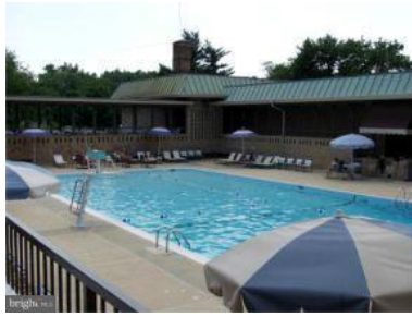
Club House1 outdoor pool