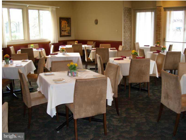
Community dining option