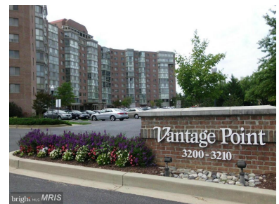
Vantage Point West