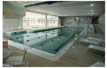
Indoor pool next door at Club House 2