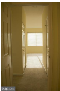
Hall into master bedroom