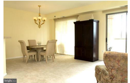
View from living area