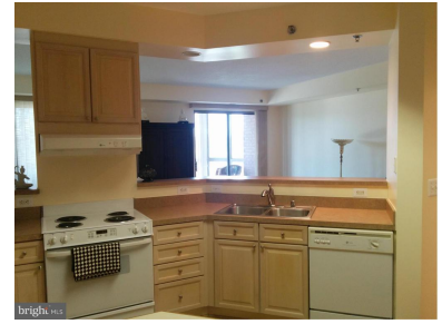
View of pass thru to living room