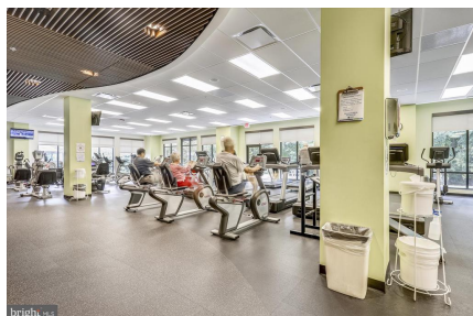
Building Community Fitness Center