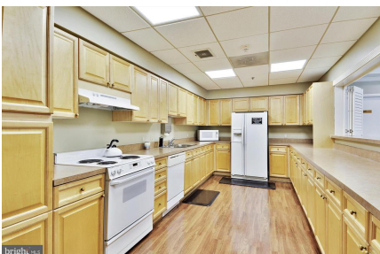
Building Community Kitchen