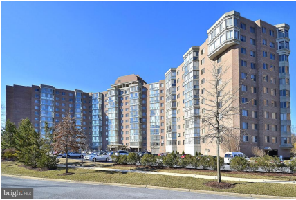
Vantage Point East Front Elevation