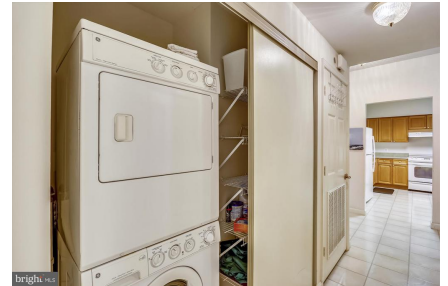
Washer/Dryer in Unit