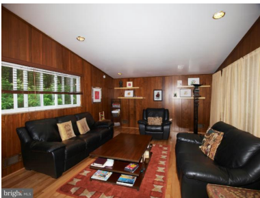
Family Room View 2