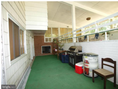
Interior Porch 1