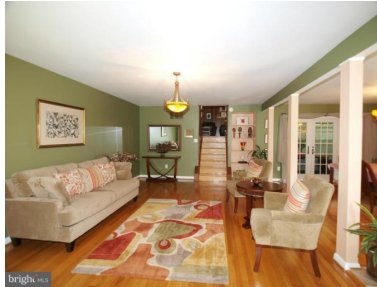
Living Room View 2