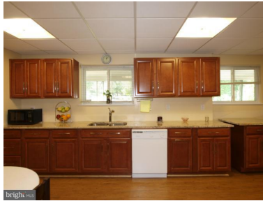
Kitchen Part 1