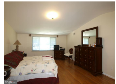
Bedroom (Master) View 2