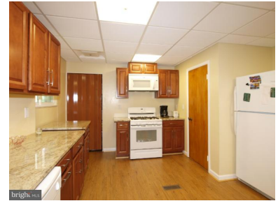
Kitchen Part 2