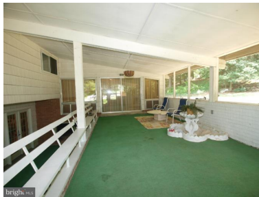
Interior Porch 2