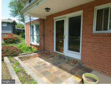
Covered Entry Porch