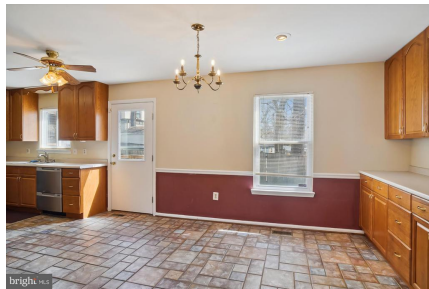
Breakfast area, door to deck