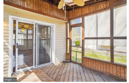
Access screen porch. Sliders from family room.