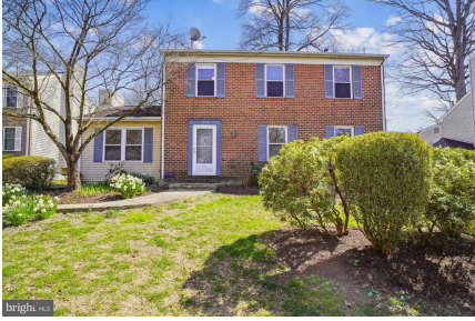
1304 Heather Cret Terrace .