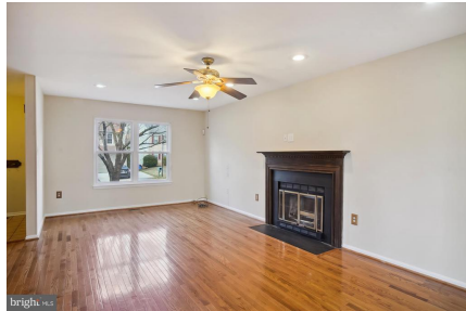
Family room with fireplace