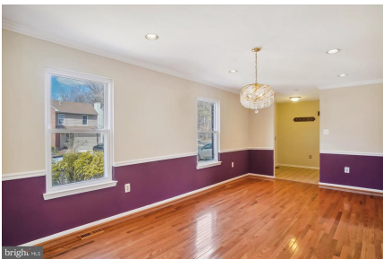
Reverse view of dining room toward foyer.