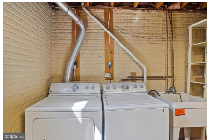
Laundry room, lots of storage space.