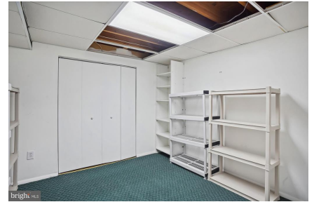
Closet, storage in guest room/office.