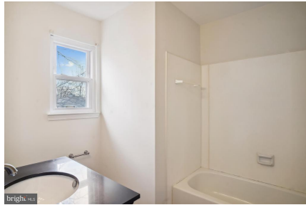
Upstairs hall bath. Upgraded vanity, new floors.