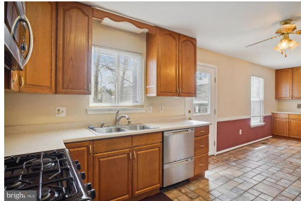
Huge kitchen. Double drawer dishwasher