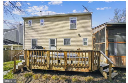
Back view of deck, porch.