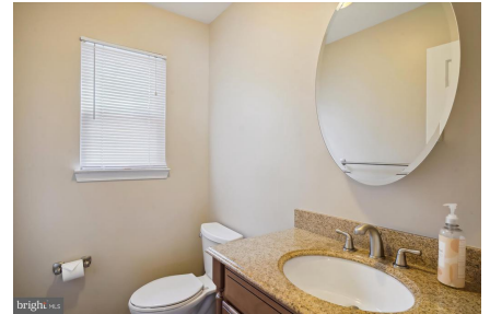
Lovely main level powder room.