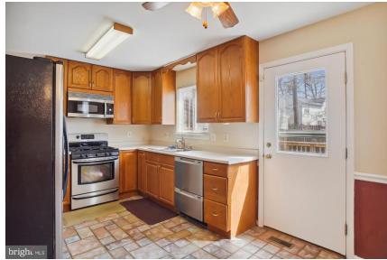
View across kitchen, approach to deck.