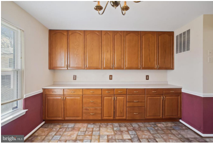
Bonus cabinets and shelving. Large eat in area.