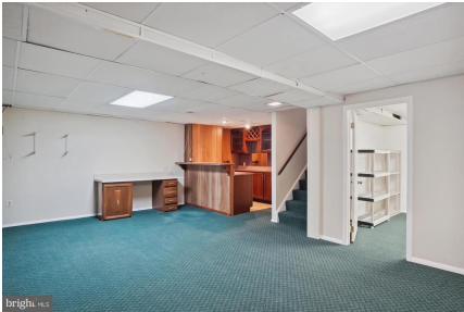
Lower level recreation area, bar, guest room.