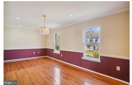
Dining room w/ custom wood floors, natural light.