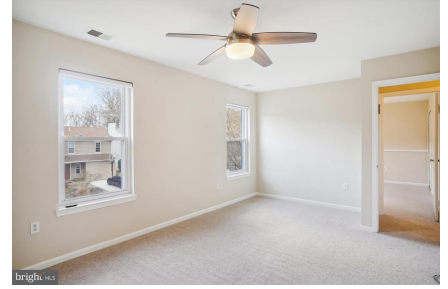
Primary bedroom: new carpet, 2 windows.