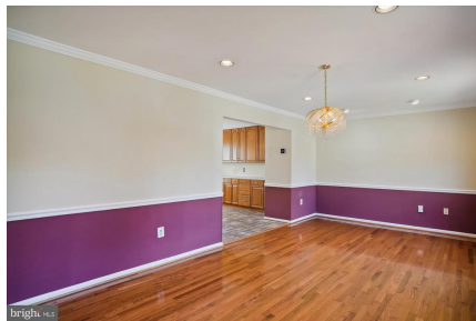
View across dining room, entry into kitchen.