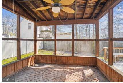
Ceiling fan in center of porch.