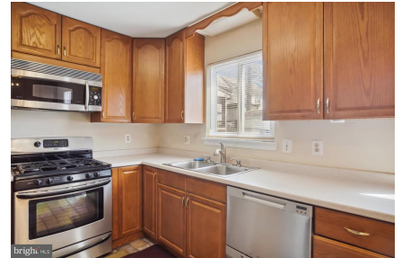
Lots of counter space, stainless appliances.