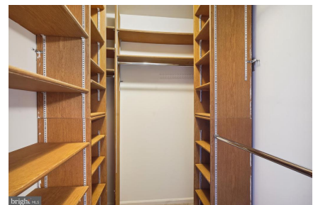
Amazing walk in closet in primary bedroom!