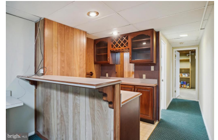
Equipped bar with overhang, wine rack, min fridge.