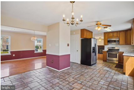
View from breakfast area across kitchen.