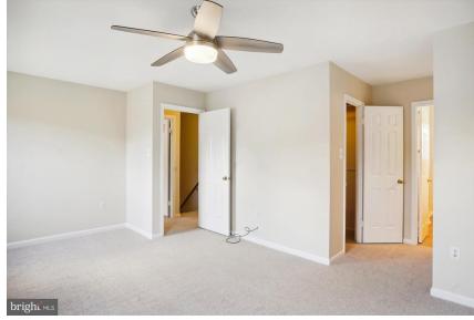
Ceiling fan, view of entry, walk in closet, bath.