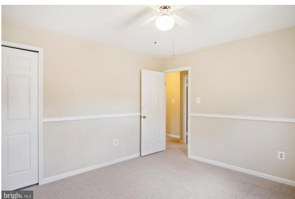
View across bedroom to closet, to hall.