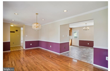
View across dining room into kitchen, foyer.