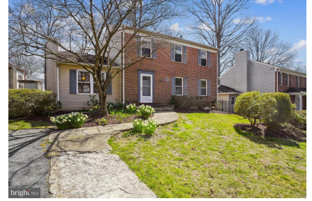
Approach to house, landscaping