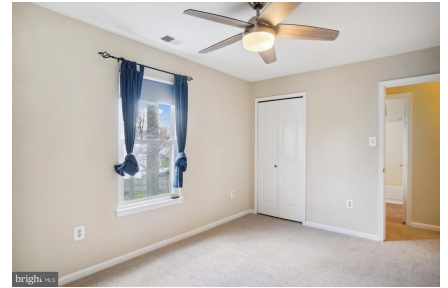
Bedroom 1 . view to backyard. Closet, to hall.