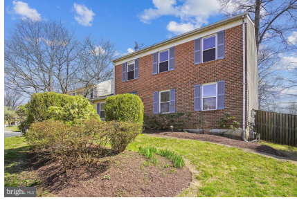
Nice elevated yard.