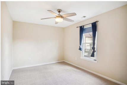
Ceiling fan, new carpet.