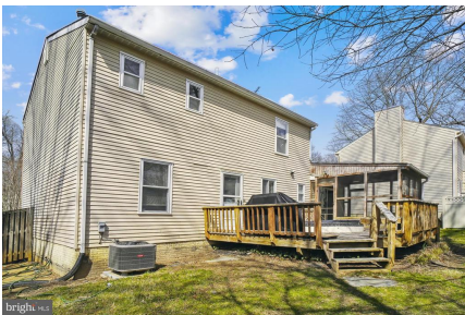
Side view of deck, porch.