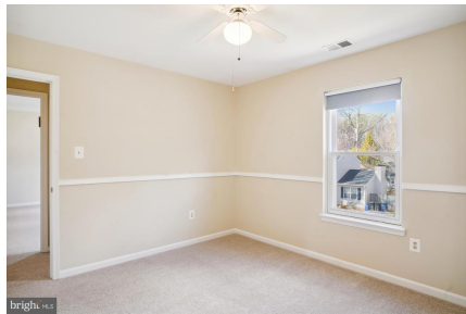
Bedroom 2 with ceiling fan.