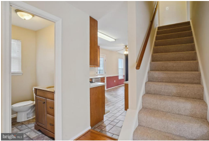
New carpeting up the stairs and into bedrooms.