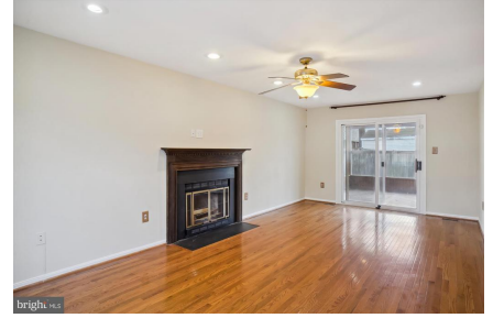
Family room custom wood floors, sliders to porch.