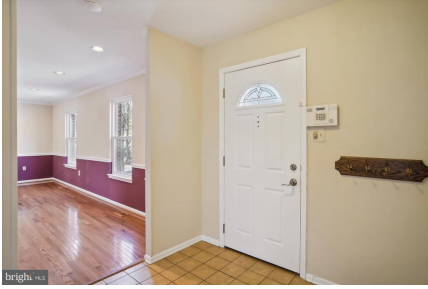
View of foyer, dining area.