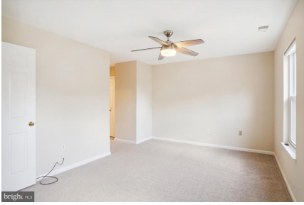
Across primary bedroom. Hall to closets, bathroom.