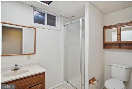
Full bath with walk in shower.