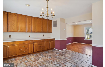
Huge kitchen with extra cabinets, breakfast area.