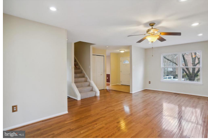
View across family room to foyer. Ceiling fan.