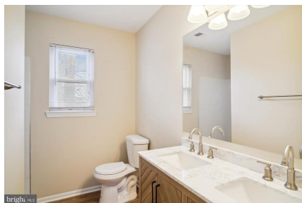
On suite-primary bath. Updated double sinks!