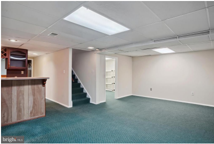
Views across recreation, steps, guest room.