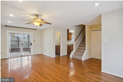
View of powder room, kitchen, upper level steps.