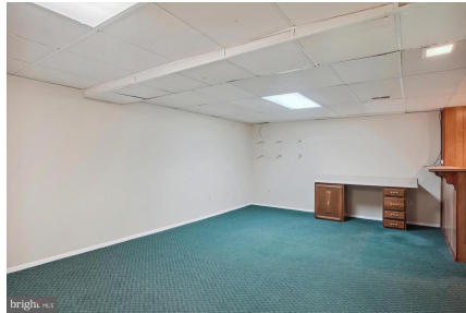
View across recreation area..