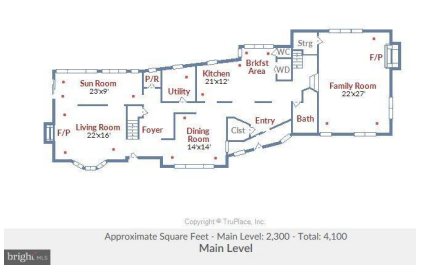
Floor Plan - Main Level