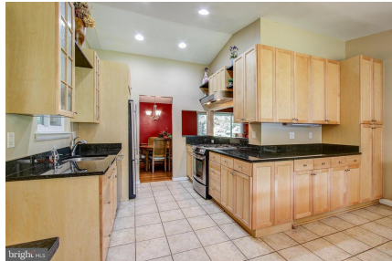
Cathedral ceiling gives open area.