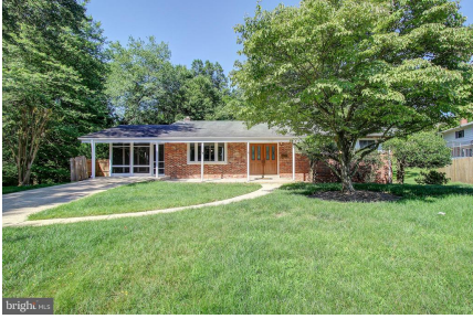
Beautiful rambler in a Kemp Mill cu-de-sac.!