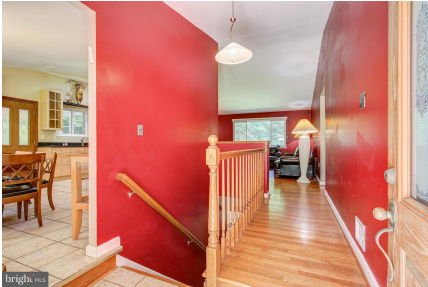
Beautiful wood floors most of main lvl.