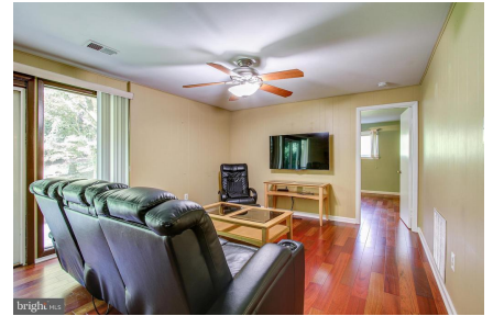
Natural light coming in.