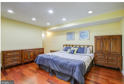
Gorgeous guest suite. flooring, recessed lights.