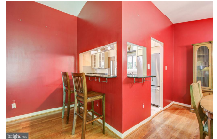
Breakfast bar, passthrough from kitchen to dining.