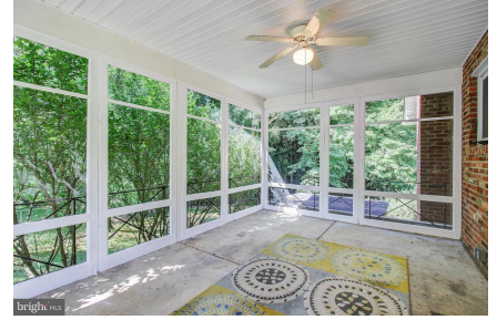
Carport converted into front porch!