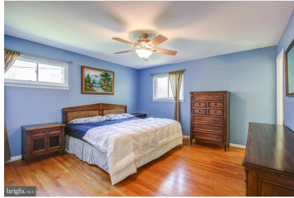
Master bedroom with 2 exposures