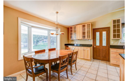
Natural light coming into eating area