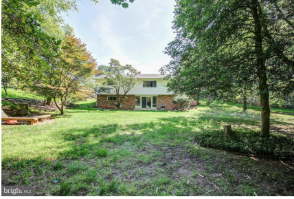
awesome yard. Backs to Northwest Branch Park.