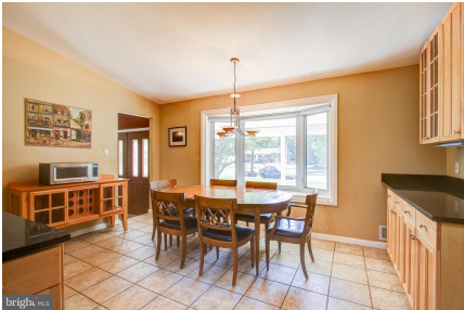
Additional cabinets and counter space added.