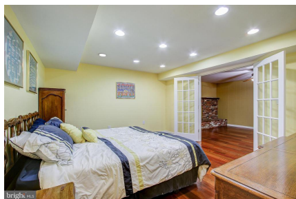
French doors for privacy. Hallway to bath.