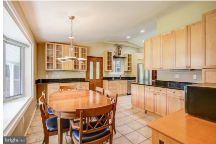
Huge kitchen. Lots of cabinets, recessed lights.