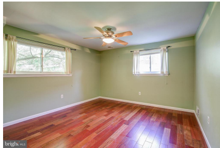
Lower level bedroom with 2 exposures