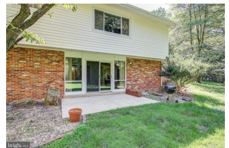
Enjoy bbqs and picnic on patio