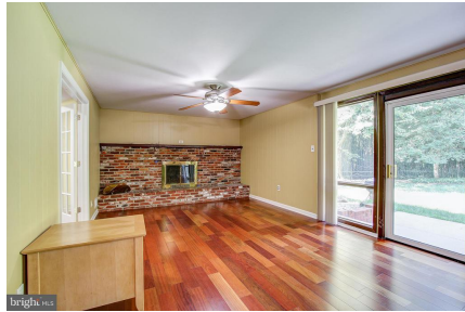
Daylight rec room. fireplace. sliders to yard.