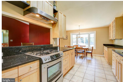
Open area for breakfast bar, pass through