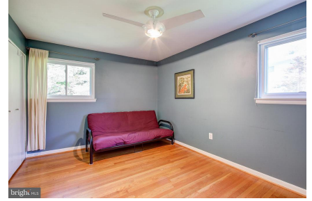
all bedrooms with wood floors