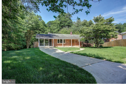
Country setting in the suburbs.