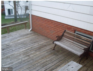
Nice sized two level deck