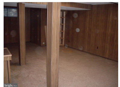
huge sub basement( 4th level)