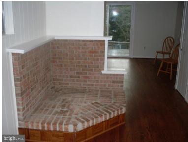
Already set up for wood stove