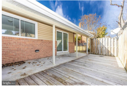
Back deck off living room