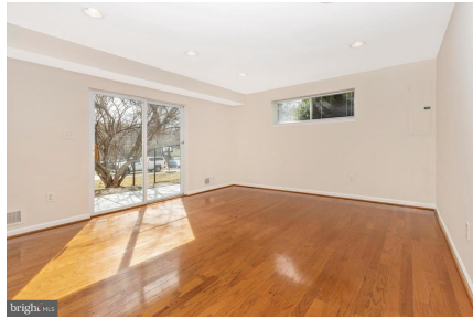
Dining room/Breakfast area