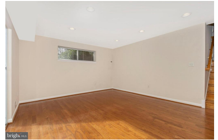
Dining room/Breakfast area