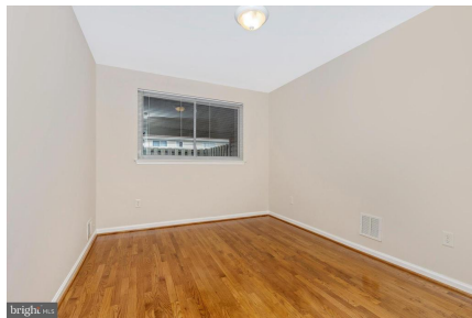
Bedroom 4 - Main level