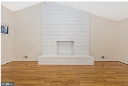
Brick hearth fireplace