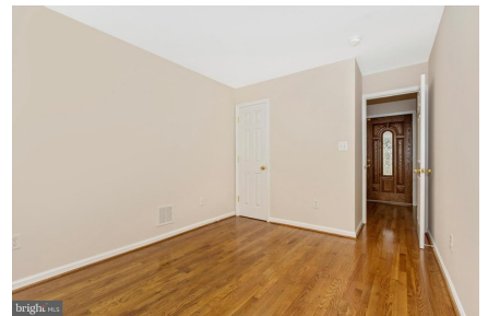
Bedroom 4 - Main level