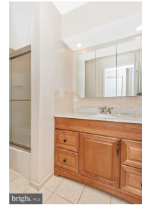
Upper hall bath