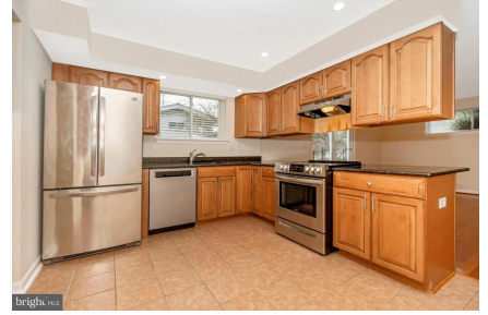
Updated kitchen - stainless steel appliances