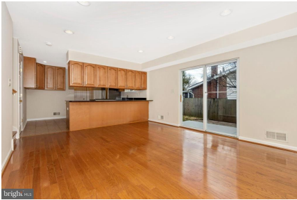
Dining room/Breakfast area