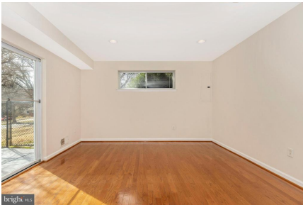
Dining room/Breakfast area