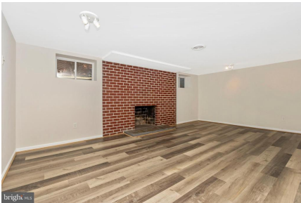
Finished recroom w/brick hearth fireplace