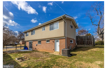
Rear of house