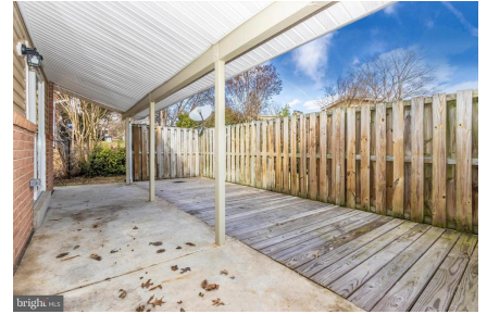
Deck & patio