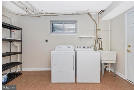
Laundry room - exits to yard