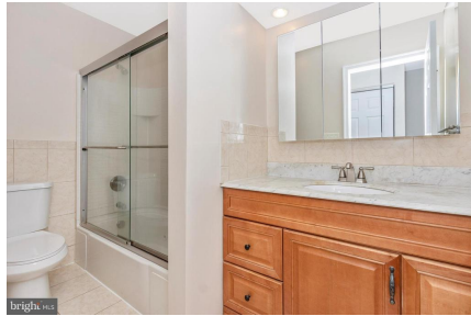
Upper hall bath - remodeled