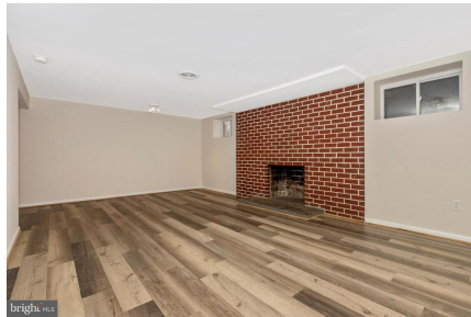
Finished recroom w/brick hearth fireplace