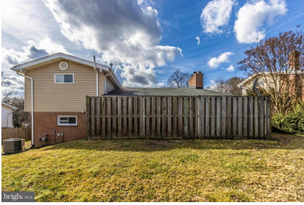
Rear of house