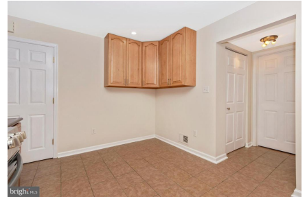
Table space - extra cabinets