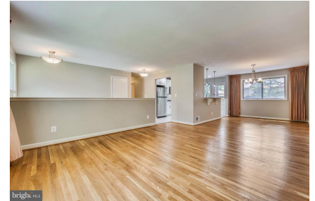
Living and Dining Room