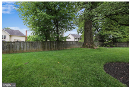
View from Back