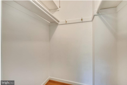
Bedroom 2 Walk-In Closet