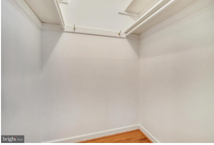
MBR Walk-In Closet