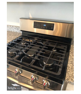
FIVE BURNER GAS STOVE