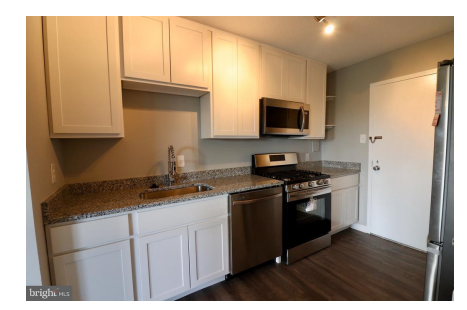
STAINLESS APPLIANCES AND BUILT IN MICROWAVE