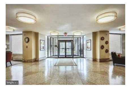
ENTRANCE LOBBY WITH MARBLE FLOORS