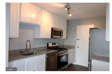
42 INCH SOFT CLOSE KITCHEN CABINETS