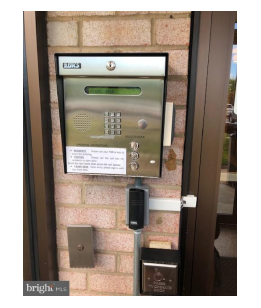
SECURED BUILDING ENTRY SYSTEM