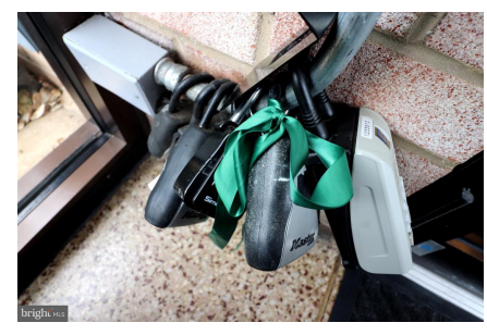
LOCKBOX HAS THE GREEN RIBBON ON IT