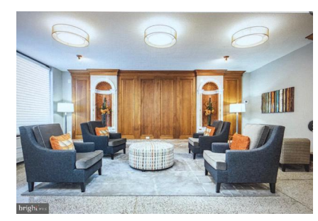
LOBBY VIEW 2