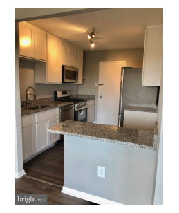
BREAKFAST BAR AREA