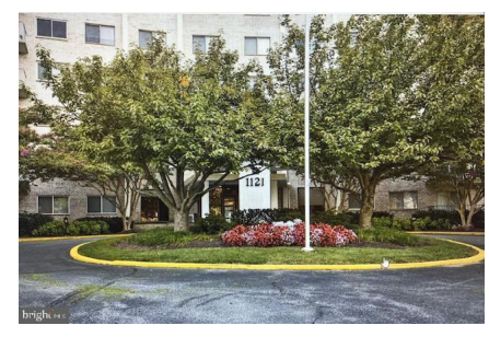
GREAT CURB APPEAL