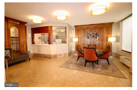
FRONT DESK AREA