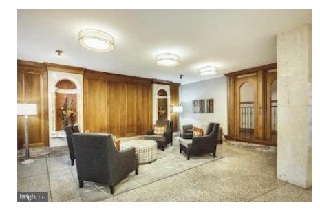
RELAX IN THE LOBBY