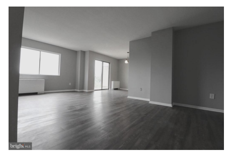
SUPER LARGE LIVING ROOMG