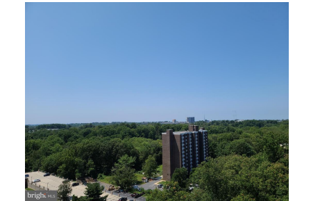
Balcony's north view faces Wheaton and sligo creek