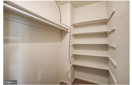
Walk In Closet