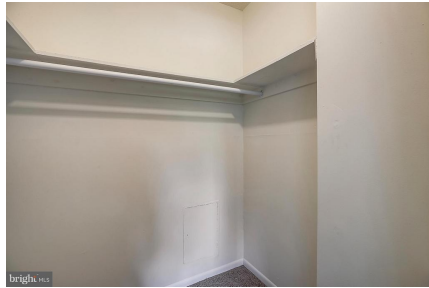
Walk In Closet