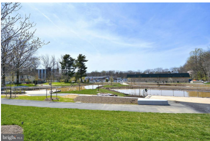
Kemp Mill Park