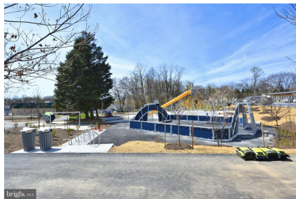
Kemp Mill Park