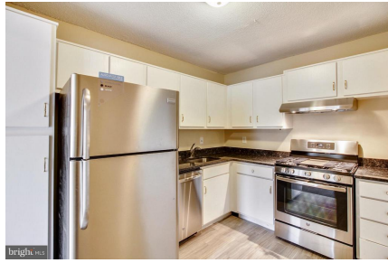
Brand New Stainless Appliances