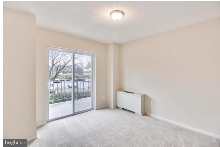
new carpet and slider!