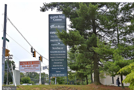
Kemp Mill Shopping Center