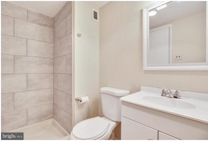
New tile work and fixtures!