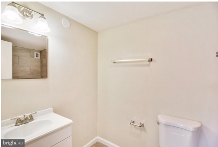
New tile work and fixtures