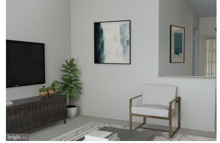
Second view of the living room