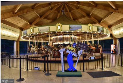
Family fun in Wheaton regional park