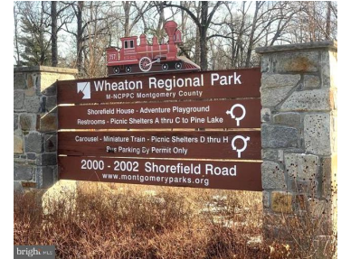
Wheaton regional park