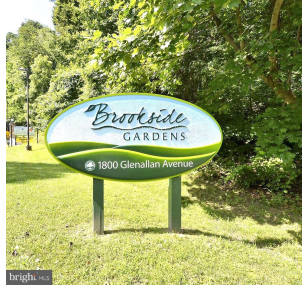
Welcome to Brookside garden