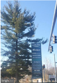
Kemp Mill shops