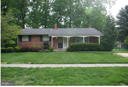
Welcome to 1115 N. Belgrade