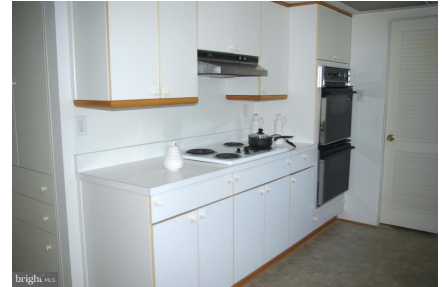
Second view of Kitchen