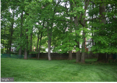
View of Backyard