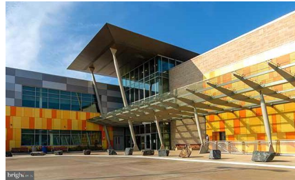
New Wheaton Library