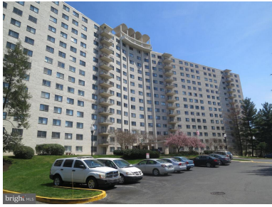
Exterior Front view