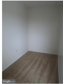
Secluded sleeping area