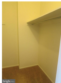
Walk in Closet