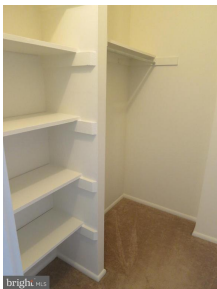
Walk in Closet