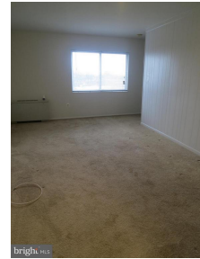
View of Living area