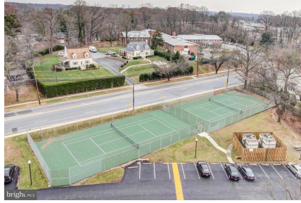
Community Tennis court