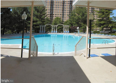
outside community pool