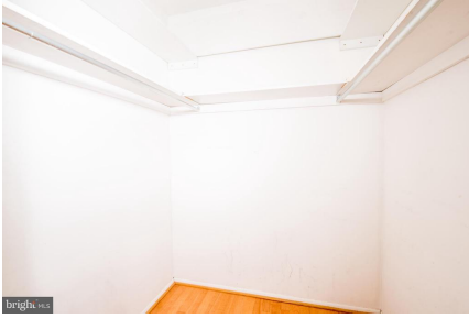
walk in closet of master bedroom