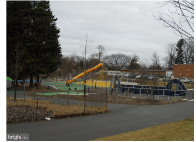
Kemp Mill Park