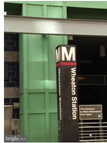
Red Line Wheaton Metro stop