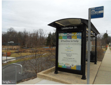
Bus stop right by University Towers