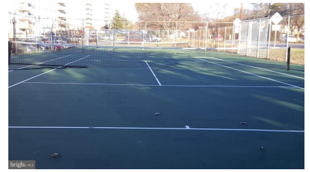
Community tennis court