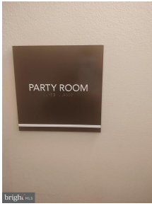
Community party Reserve through mgmt.