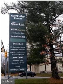
Kemp Mill Shopping Center a few blocks away,