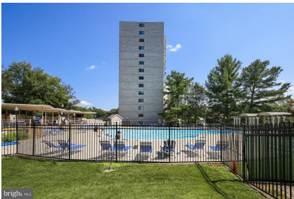
Community Swimming Pool