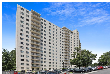
View to Building