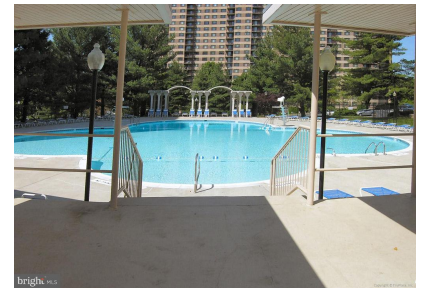
Community Swimming Pool