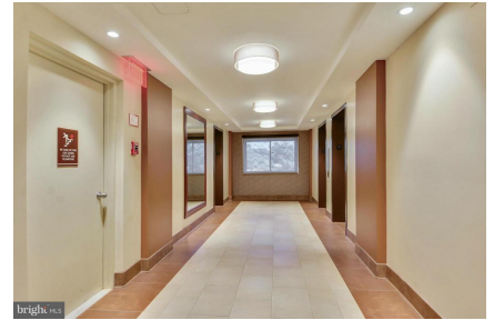
Remodeled Hallway Elevator Area