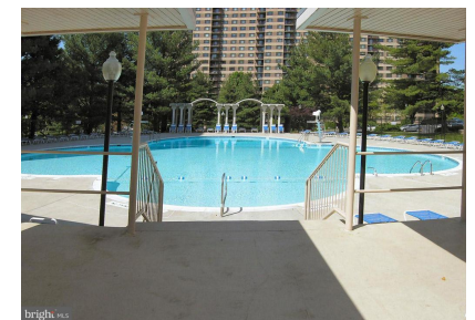
Community Swimming Pool