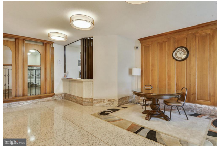
Building Welcome Desk