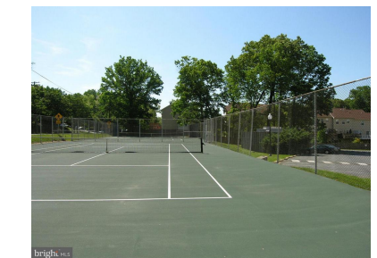
Community Tennis Court