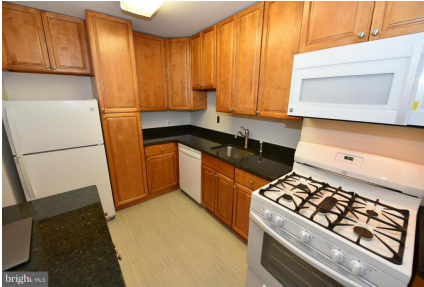
Brand New Granite Kitchen