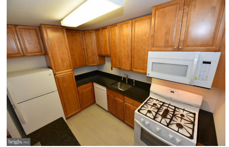
Brand New Granite Kitchen