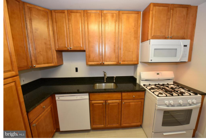
Brand New Granite Kitchen