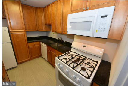
Brand New Granite Kitchen