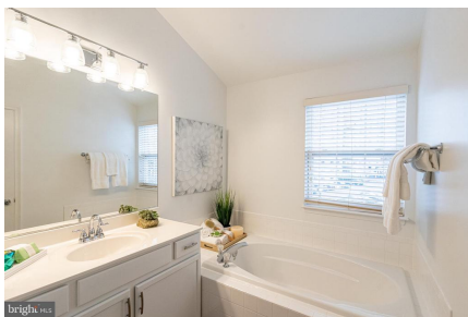
Updated Owner's Bath