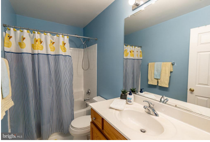
Full Hall Bath #2