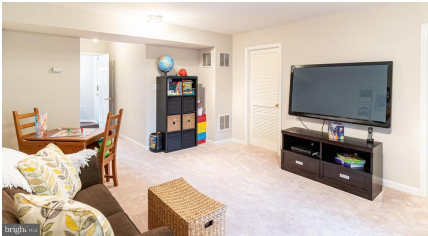
Rec Room/Bedroom #4 w/Access to Garage + Laundry