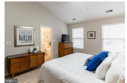
Owner's Suite w/Walk-in Closet