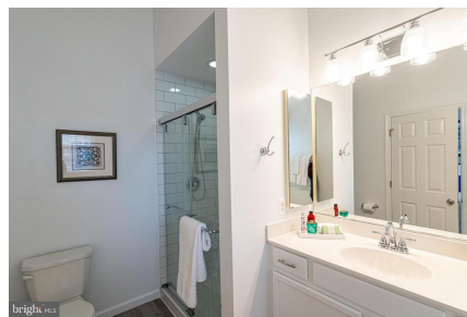
Updated Owner's Bath