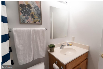
Full Bath #3