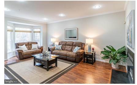
Family Room w/Bay Window