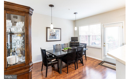
Dining Room w/Access to Deck