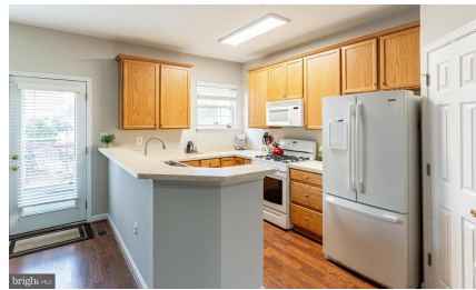
Kitchen w/Breakfast Bar