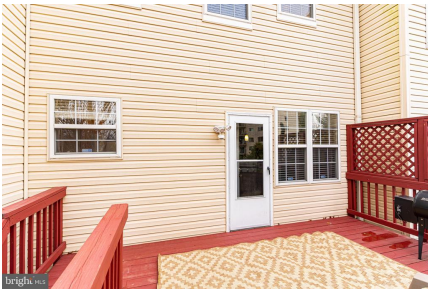
View of the Rear Exterior