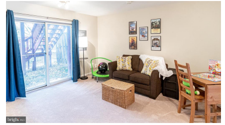
Walk-out Rec Room/Bedroom #4