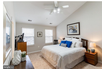
Owner's Suite w/Vaulted Ceilings