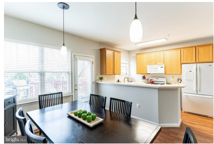
Kitchen open to Dining Room