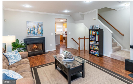
Family Room w/Gas Fireplace