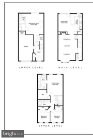
11004 Hemingway Ct Floorplans