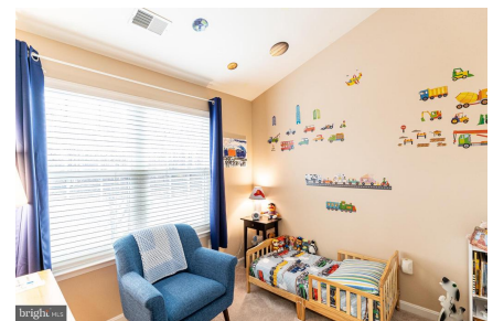
Bedroom #2 w/Double Door Closet