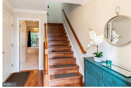
Foyer + Garage Entry