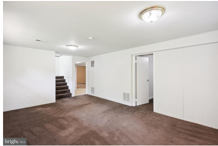
Lower Level Rec Room