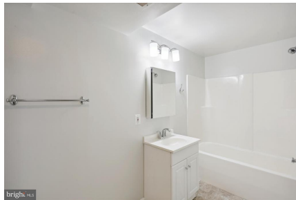
Lower Level Bath