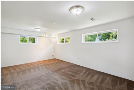
Lower Level Rec Room