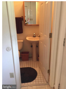
Entry level renovated powder room