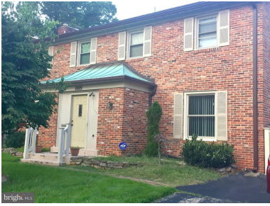
Gracious all-brick colonial