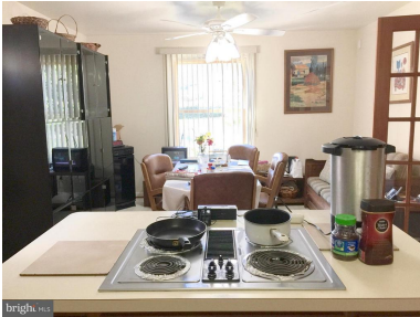
Huge Breakfast room attached to the kitchen