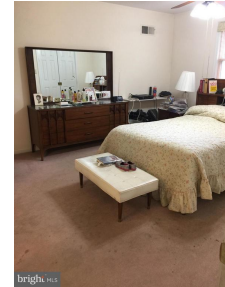
Large Master Bedroom with walk-in closet