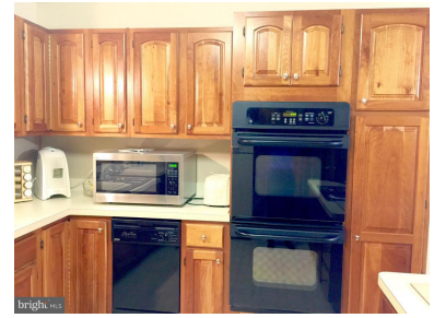
Two GE Profile Ovens, 2 dishwashers