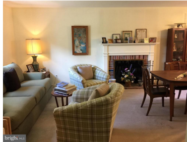
Gracious Living Room, New gas fireplace insert.