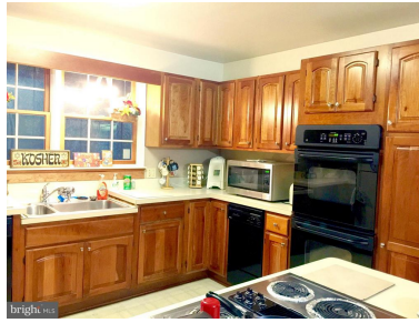
Kraft Made Cherry Kitchen