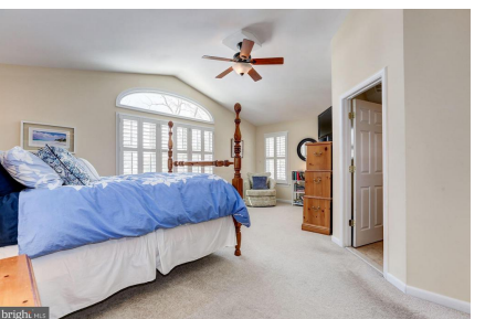
MASTER SUITE W/ SITTING AREA