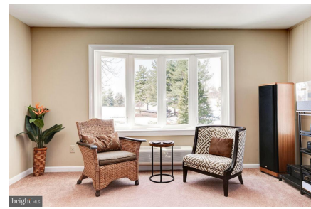
SITTING ROOM OPEN TO FAMILY ROOM