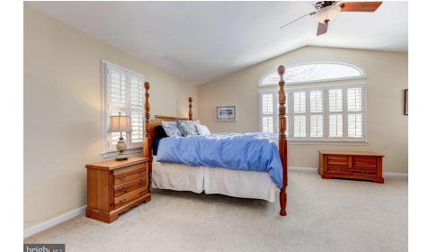
MASTER SUITE W/ VAULTED CEILING