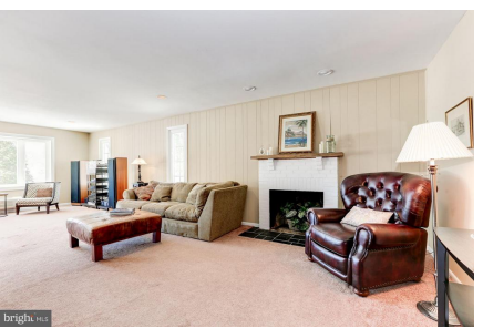
FAMILY ROOM W/ WOOD BURNING FIREPLACE