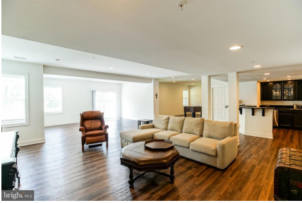
Walk-out Recreation Room w/Wet Bar and Game Area