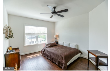
Bedroom #4 w/Buddy Bath