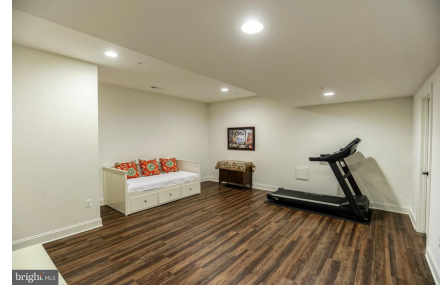
Lower Level Exercise Room