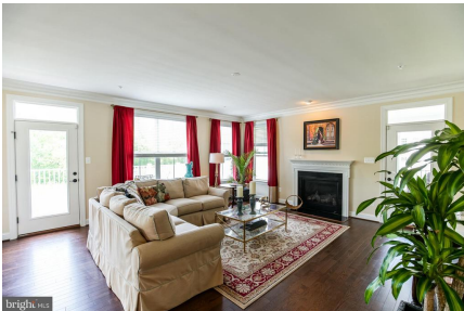
Family Room w/Fireplace and Access to Deck