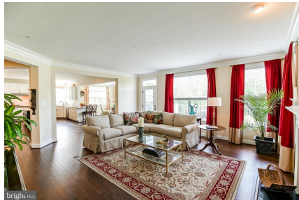
Open Concept Living