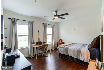
Bedroom #3 w/Buddy Bath