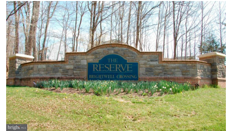
The Reserve at Brightwell Crossin