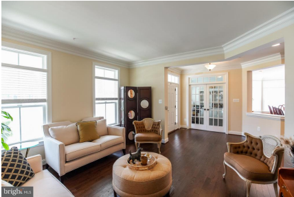
Formal Living Room