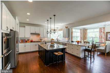
Gourmet Kitchen w/Center Island