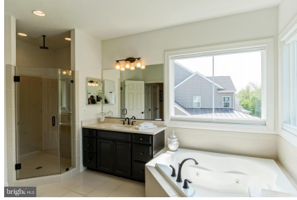
Owner's Bath w/Separate Rainfall Shower