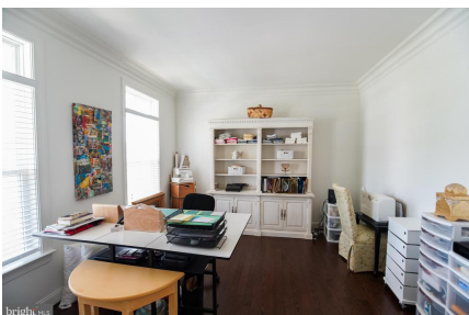
Main Level Office