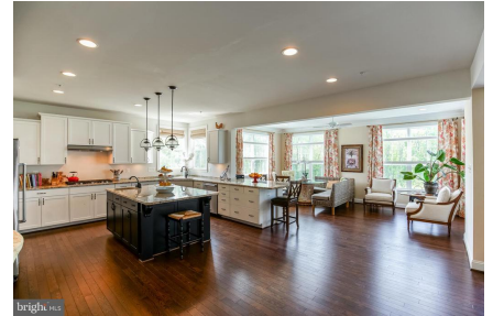
Open Floor Plan Kitchen and Breakfast Area