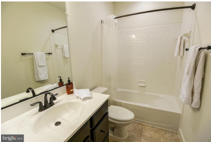
Lower Level Full Bath #4