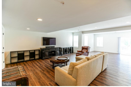
walk-out Lower Level Recreation Room