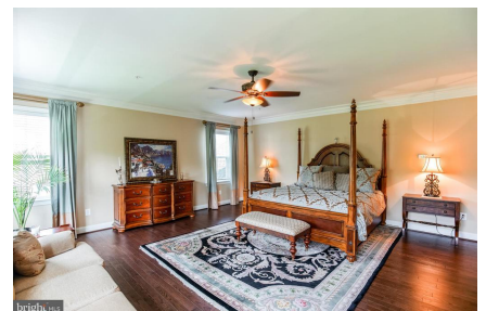
Owner's Suite w/Sitting Area