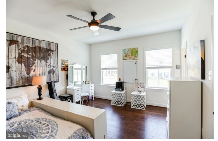
Bedroom Suite #2