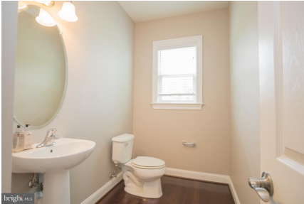
Half bath on main floor