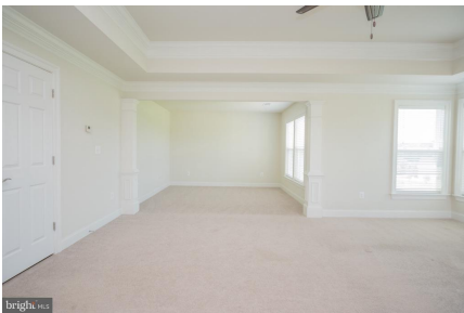
Master Bedroom with seating area