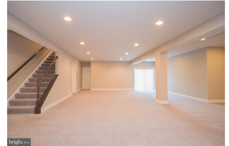
Fully Finished Basement