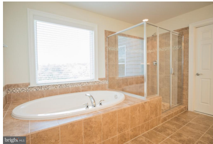
Master Bath Shower and soak in tub