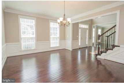
Formal dining room