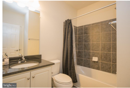
Full bathroom in basement