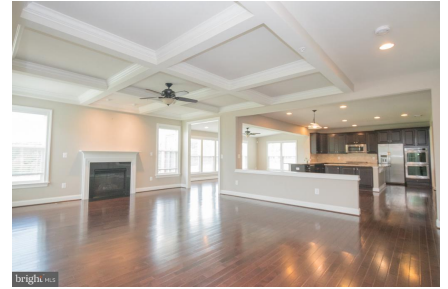
Family Room/Kitchen/Sunroom- Open concept