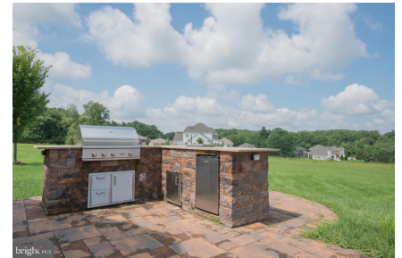
Outdoor Grill and kitchen