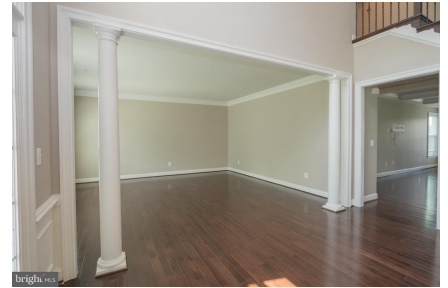
Formal Living Room