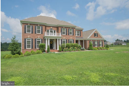
Exterior Brick Front