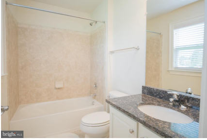
Bath #2 on second floor