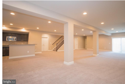
Fully Finished basement