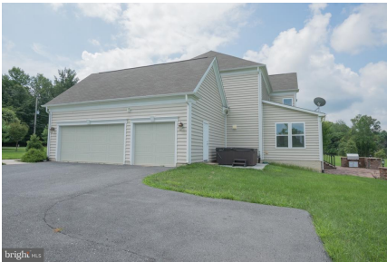
Side Entrance 3 car garage