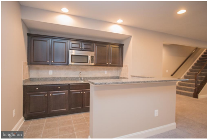
Basement Wet bar