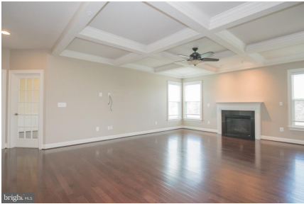
Family room with fire place and box beam ceiling