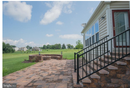
Outdoor patio with gas firepit