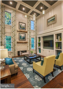
Duncan Family Room