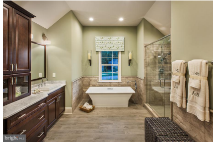
Duncan Master Bath