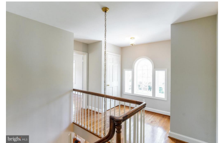
Upper Level Landing