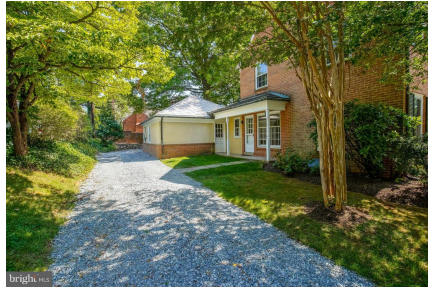
Side Entrance w/Access to Kitchen