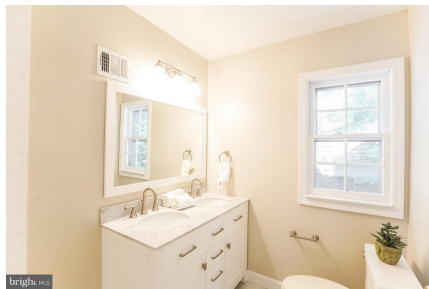
Owner's Renovated Full Bath