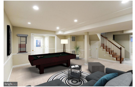
Recreation Room and Bedroom #4