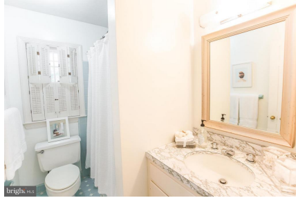
Upper Level Hall Bath