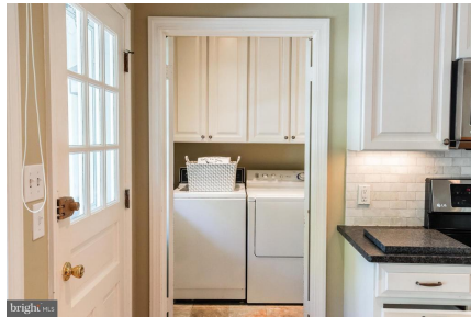
Main Level Laundry Room