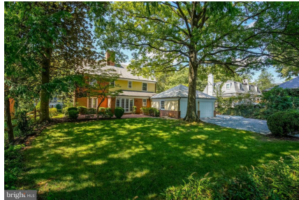
View of the Rear Exterior