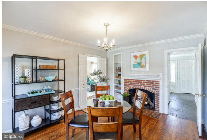
Family Country Kitchen