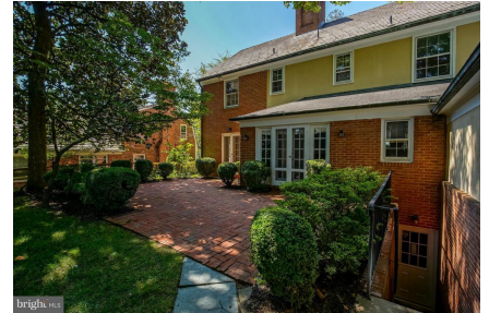
Patio showing Access to Lower Level