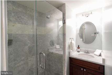
Lower Level Full Bath