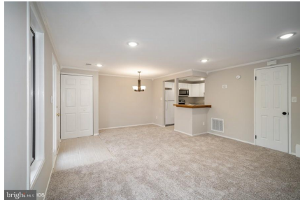
living and dining room