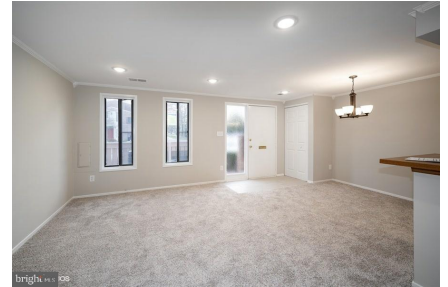
living and dining room