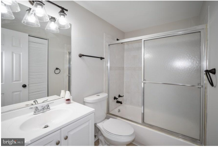
hall full bath