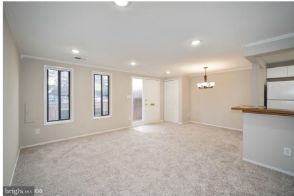
living and dining room