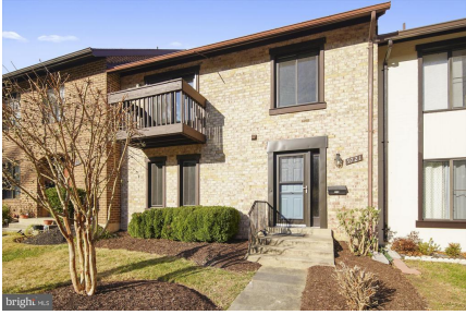
Completely Upgraded Home with Prime Lake View