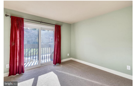
Bedroom with Private Balcony