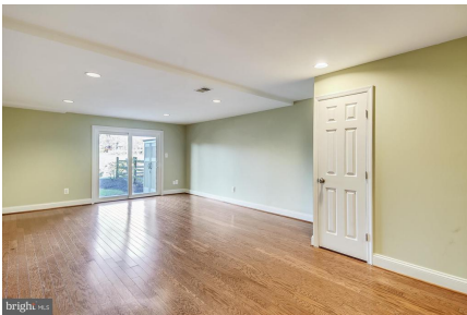
Walkout Lower Level