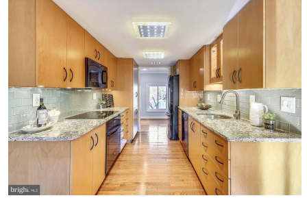
Upgraded Eat In Kitchen