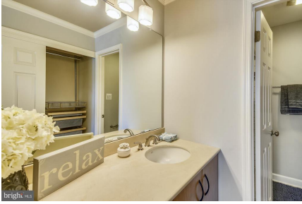
Owners' Suite Bathroom