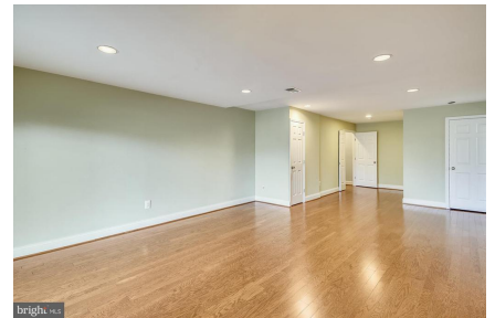
Walkout Lower Level