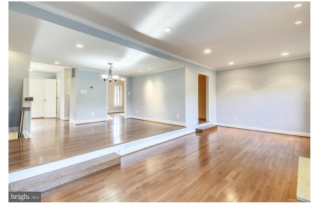
Family Room/Dining Room