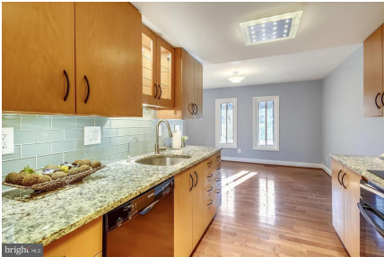
Upgraded Eat In Kitchen