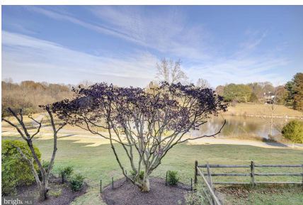
View from Upper Level