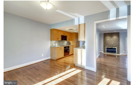
Upgraded Eat-in Kitchen