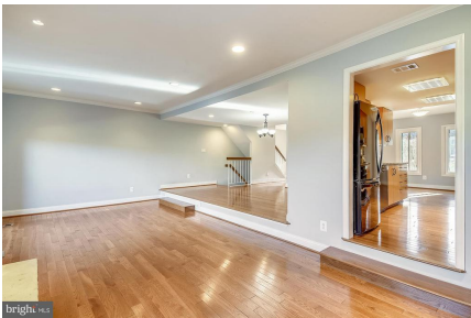
Family Room With Fireplace