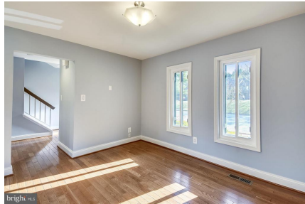
Kitchen Breakfast Area