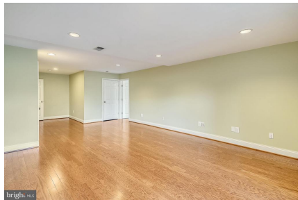
Walkout Lower Level