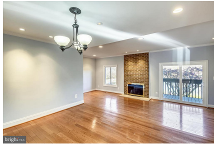
Dining Room/Family Room Open Floorplan