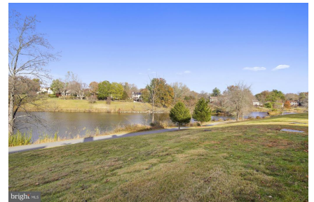
Back Yard View