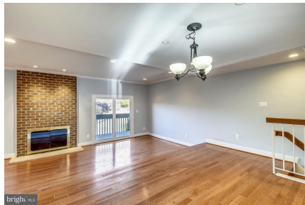
Family Room With Fireplace