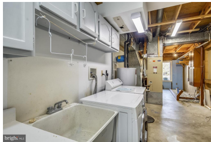
Lower Level Laundry Room