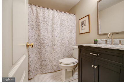
Main Level Full Bath