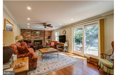
Family Room with Gas Fireplace