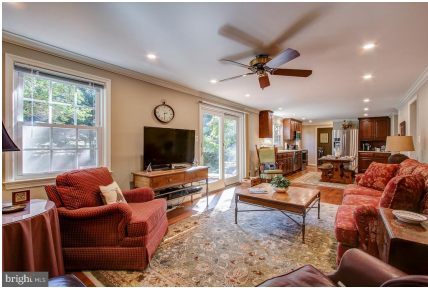
Family Room with Access to Patio