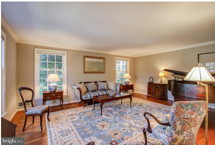
Living Room with side windows