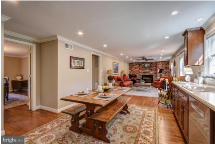
Open Kitchen and Family Room