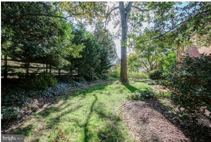
Fenced Rear yard