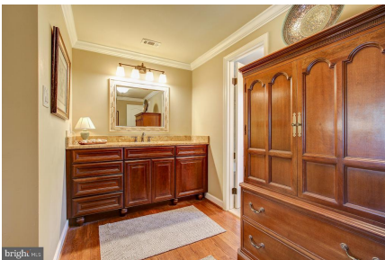
Master Dressing area with Vanity and Sink