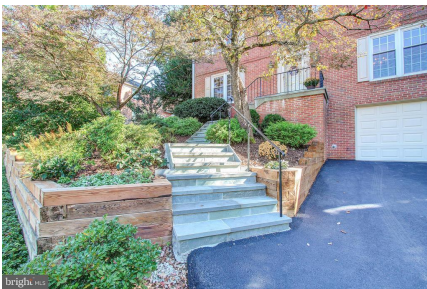
Stone front walkway