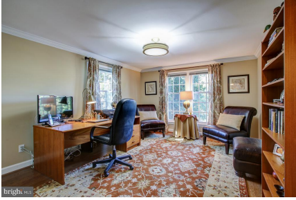
Study or 6th Bedroom with closet