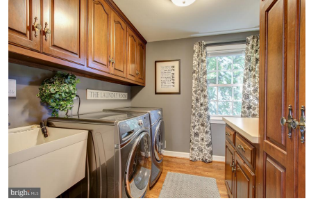
Main level laundry with front load washer & dryer