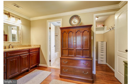
Master Dressing Area