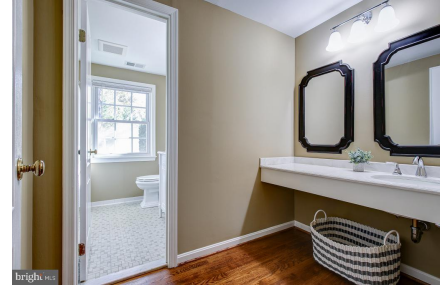
Hall Bath Dressing area with Sink