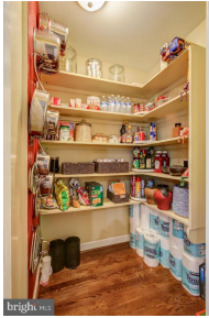
Walk in Pantry