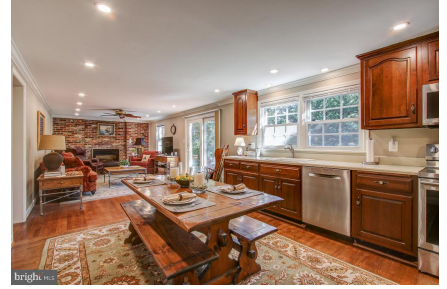
Kitchen with Stainless Steel appliances