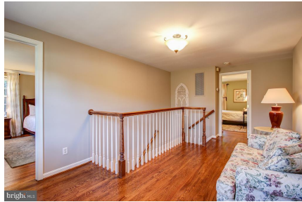
Upper Level Family Room