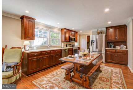
Kitchen with Cherry Cabinets