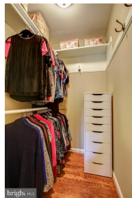
Master Walk-in Closet