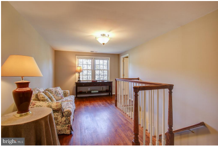
Open Family Room at the Top of the Stairs