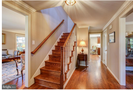
Foyer with oversized coat closet