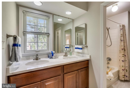
Updated Master Bath with Double Vanity