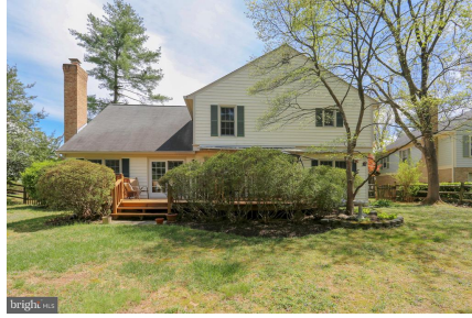
Back of Home