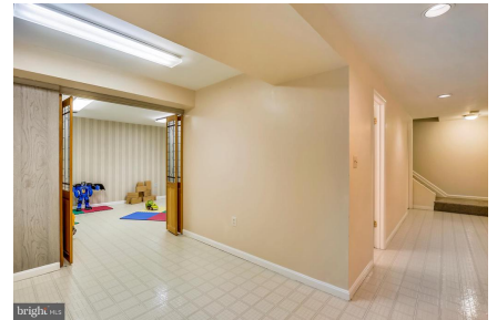
Finished Bsmt w/ Rec Room, Bath, Utility/Storage