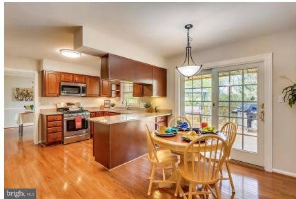
GORGEOUS Updated Eat-in Kitchen