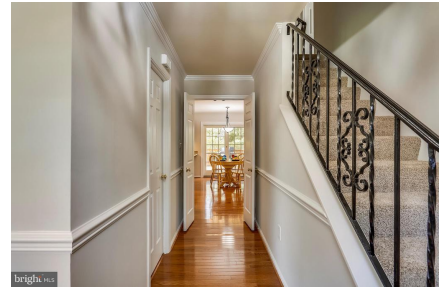
Stairs to Upper Level - NEW Carpet Upper Level