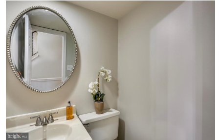
Powder Room on Main Level