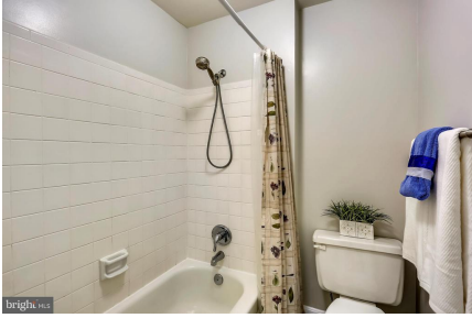
Master Bath w/ Tile Floor and Surround