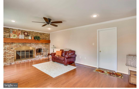
Family Room with Recessed Lighting