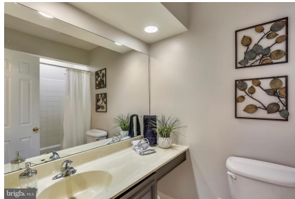
Updated Hall Bath