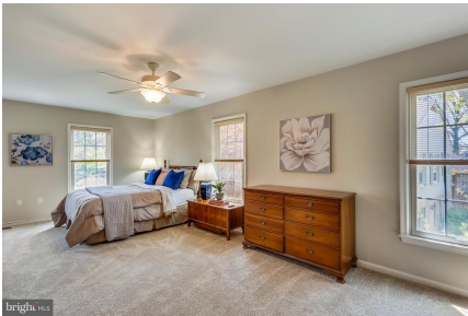
Huge Master Bedroom Suite