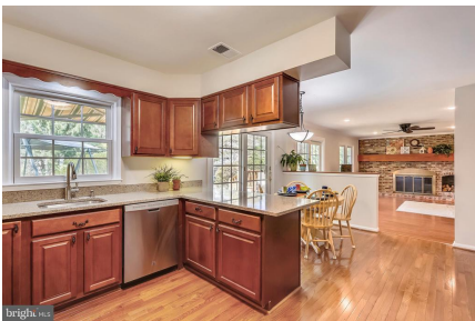
Kitchen with New Cabinetry and Quartz Counters