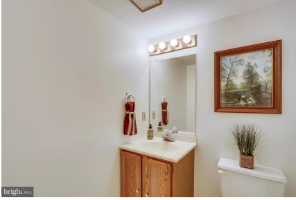
Lower Level Powder Room