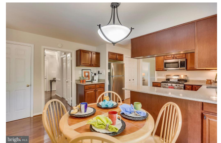
Eat-in Area with NEW Brushed Bronze Chandelier