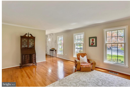
Living Room with Crown Molding