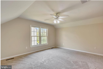
Huge Second Bedroom