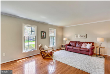
Sun-filled Living Room with Hardwood Floors