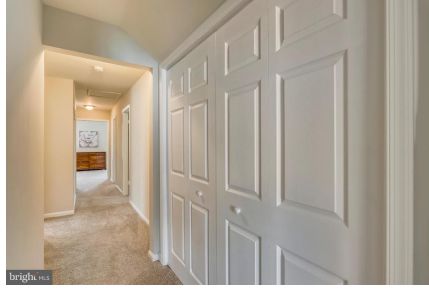
Laundry Room on Upper Level