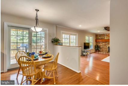
Kitchen/Family Room w/ 2 Sliding Doors to Deck