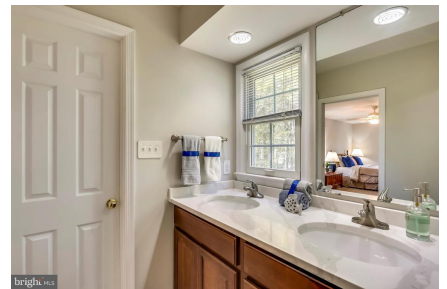
Master Bath with Quartz Countertop