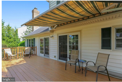
Deck with Two Sliding Doors to House