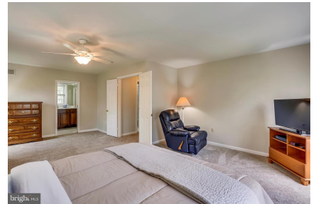
Master Bedroom with Sitting Area