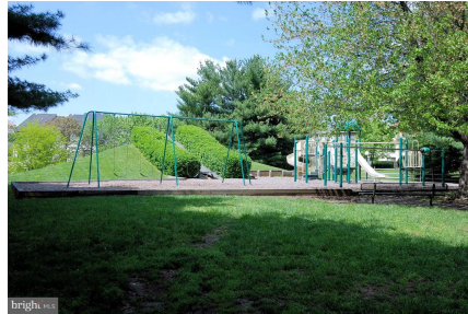
Hurley Park Playground