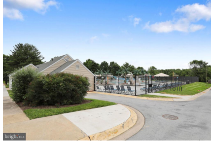
Close to the NEW Kid Friendly Apple Ridge Pool Kids LOVE the New Apple Ridge Pool - Adults too!