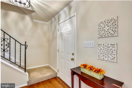
Inviting Foyer with NEW Brushed Bronze Light