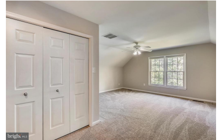
Second Bedroom with Large Closet