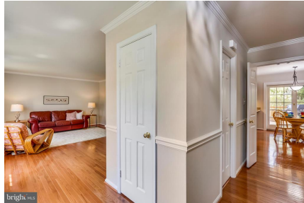
Impeccable Hardwood Floors on Main Level