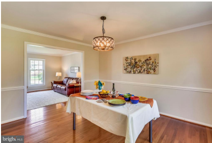
Dining Room with New Brushed Bronze Chandelier