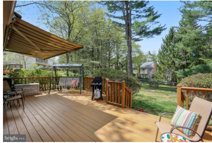
Huge Deck off Family Room and Kitchen