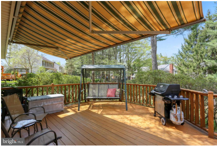
Deck with Large Attached Awning