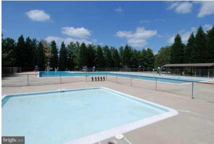
Walk to Hurley Park Pool