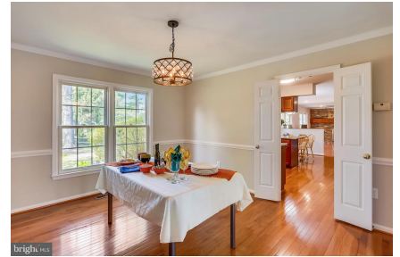
Dining Room Crown Molding and Chair Rail