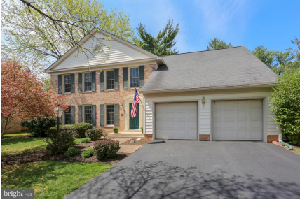
Welcome to 20304 Highland Hall Drive...