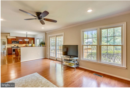
Family Room with Hardwood Floors