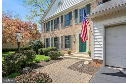
Brick Walkway to Front of Home - Great Curb Appeal