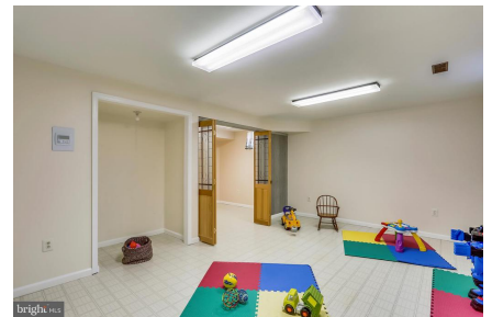
Large Rec Room