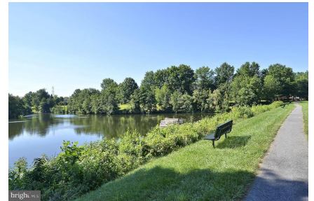
Walk to North Creek Lake