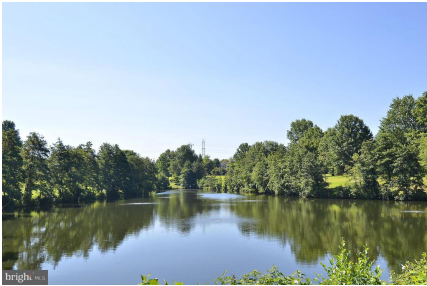
North Creek Lake