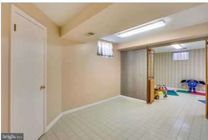
Finished Lower Level with Tons of Space