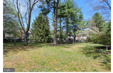
Beautiful Yard with Mature Landscaping