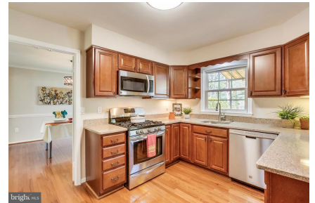
Updated Kitchen with Stainless Steel Appliances