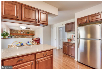
Kitchen With Radio/Bluetooth Intercom System