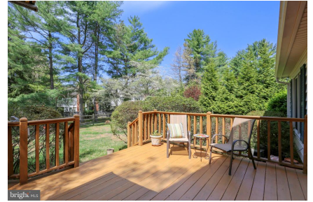
Deck Overseeing Beautifully Landscaped Yard