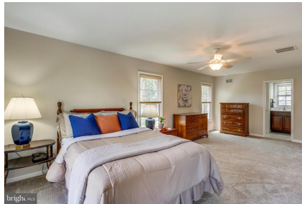
Master Bedroom w/ Updated Bath and Walk-in Closet