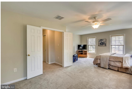
Sun-Filled Master Bedroom with Double Doors