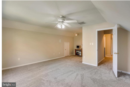
Bedroom with Access to Walk-in Storage in Eaves