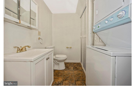
Powder Room / Laundry Area