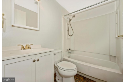
Full Bath 2nd Level