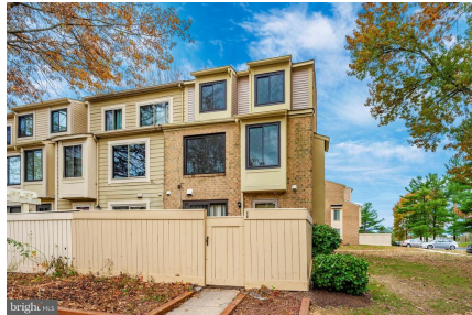
Exterior Front (End/Corner Unit)