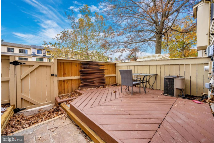
Exterior Front (Private Patio Area)