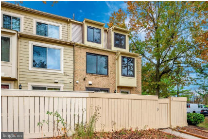
Exterior Front (End/Corner Unit)