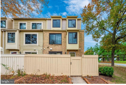
Front (End/Corner Unit)