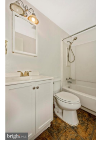
Full Bath 2nd Level