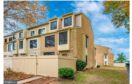
Exterior Front (End/Corner Unit)