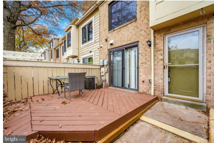
Exterior Front (Private Patio Area)