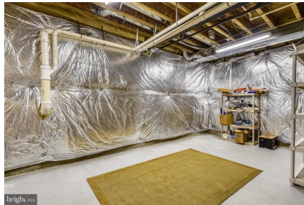
Lower level storage