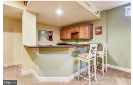
Lower level bar