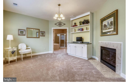
Master bedroom sitting room