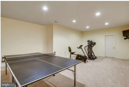
Lower level game room