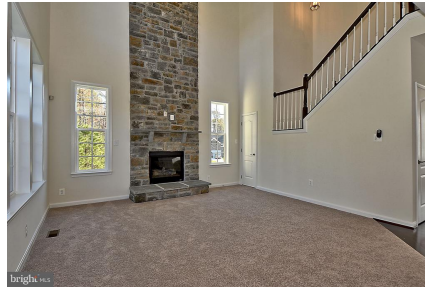
Two Story Family Room