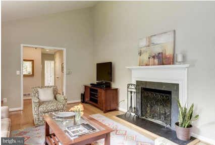
Living room with wood-burning fireplace