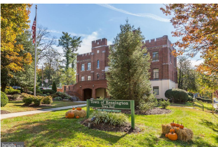
Kensington Town Hall