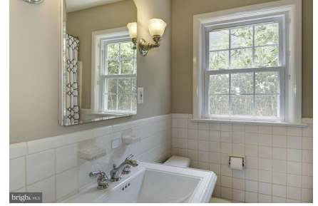
Updated hall bath with tub & shower