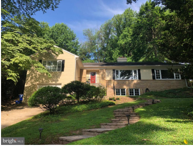
Lovely updated rambler w/private, tranquil setting