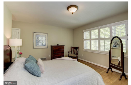
Master bedroom with wall of windows