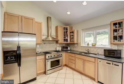
Sink with window above