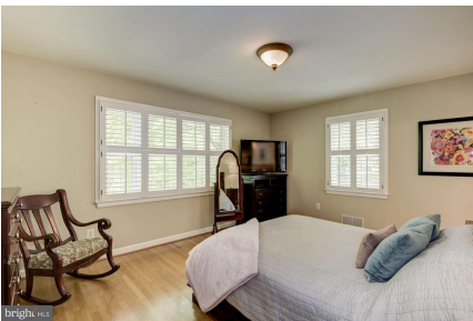
Spacious master bedroom w/2 closets