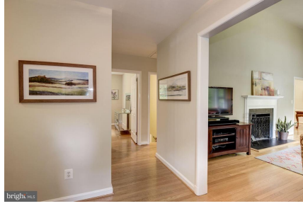
Bright entry foyer with coat closet