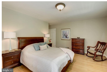
Another view of the master bedroom