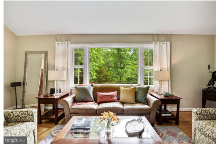
Another view of living room with serene views