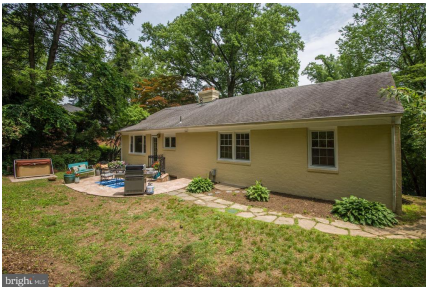
Rear view of stone walkway