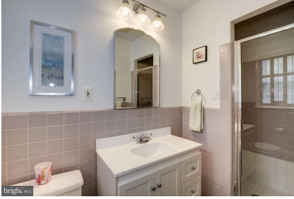
Master bath with walk-in shower