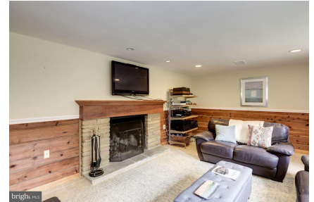
Rec Room with Wood Burning Fireplace