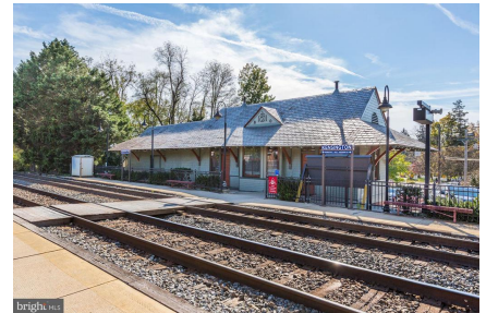
Another view of train station