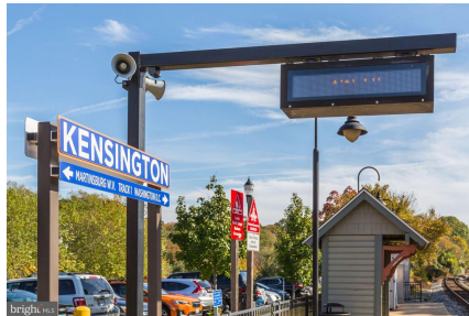
Kensington Marc Train Station