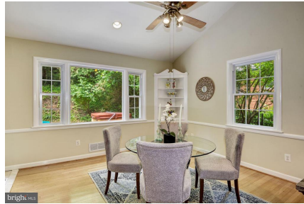
Dining area with peaceful views