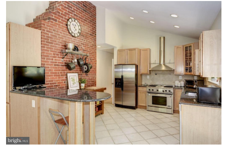
Chef's kitchen w/granite & SS appliances