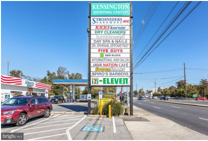
Shops in the heart of Kensington