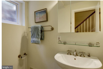
Lower Level Bathroom with Shower