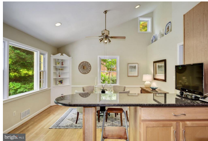
Soaring ceilings in the kitchen & dining area