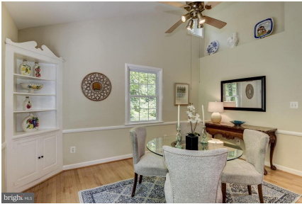
Spacious dining area