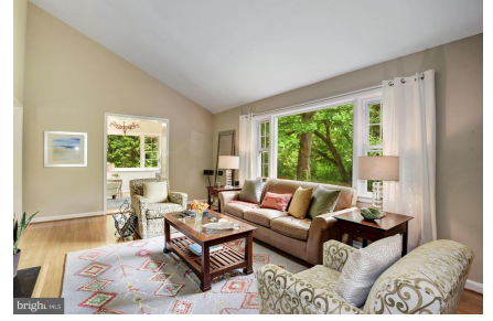
Inviting living room w/soaring ceilings