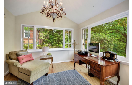
1st floor den