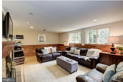
Bright & large lower level recreation room