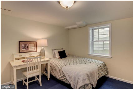
Lower Level Fourth Bedroom