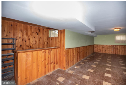
Basement Family/Rec Room