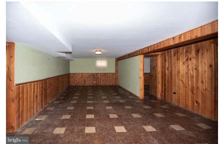
Basement Family/Rec Room