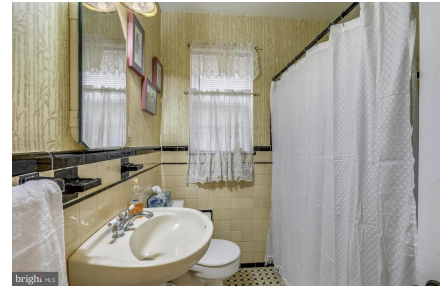
First Floor Bath