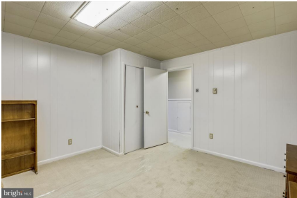
Study in Lower Level