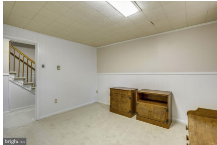
Study in Lower Level