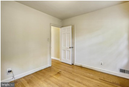
First Floor Bedroom