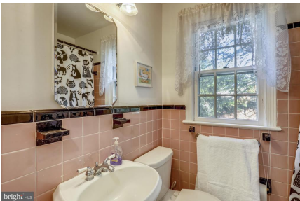
Upper Level Bath