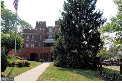
Kensington Town Hall