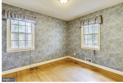
First Floor Bedroom