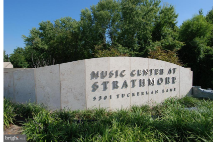
Close by Strathmore