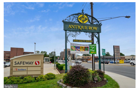
Kensington Antique Row