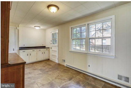
Den off Living Room