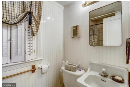
Half Bath Lower Level