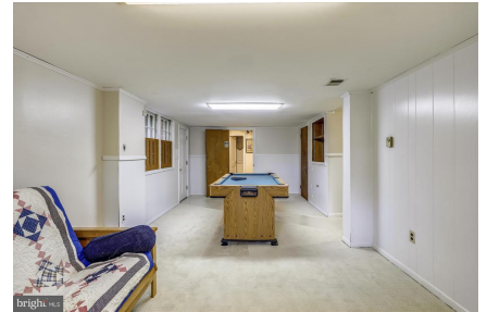
Family Room Lower Level