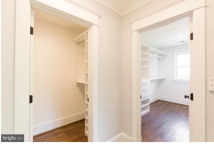
Dual Walk In Closets in Master Bedroom