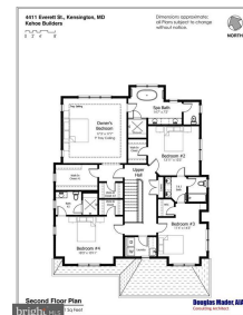
Upper Level Floor Plan