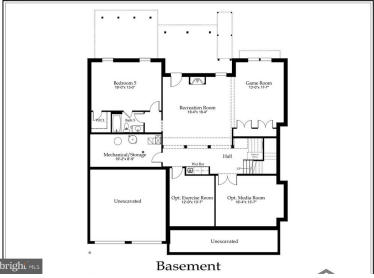
LL walkout w/5th BR, Ba, Rec Rm w/gas FP, wet bar