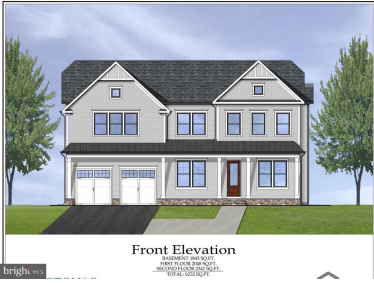
Front porch with metal roof, stone detail.