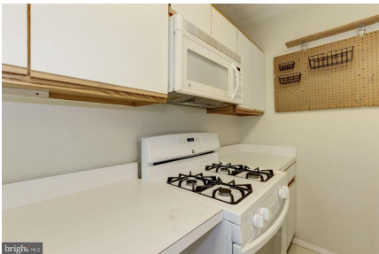
Kitchen with gas stove