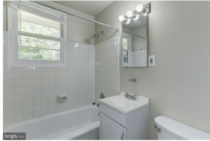
Full hall bathroom