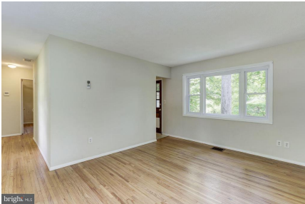
Entry hall, living & dining, kitchen door