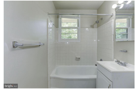
Full hall bathroom