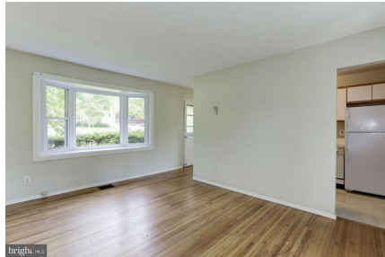
Living & dining