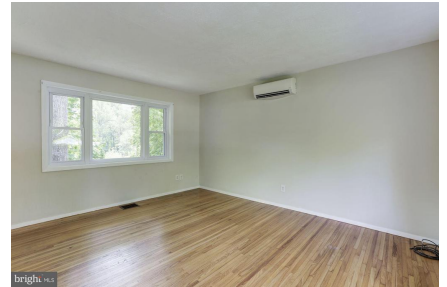
Living & dining area