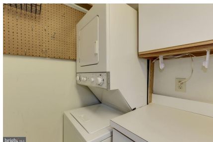
Convenient stackable washer/dryer in kitchen