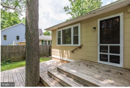
Shady rear deck