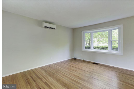
Living & dining